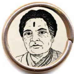
G. Durgabai Deshmukh (1909-1981)

born: Andhra Pradesh. Advocate and public activist for women's emancipation. Founder of Andhra Mahila Sabha. Congress leader. Later: Founder Chairperson of Central Social Welfare Board.