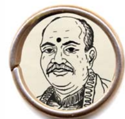
Shyama Prasad Mukherjee

(1891-1956) born: Madhya Pradesh. Chairman of the Drafting Committee. Social revolutionary thinker and agitator against caste divisions and caste based inequalities. Later: Law minister in the first cabinet of post-independence India. Founder of Republican Party of India.