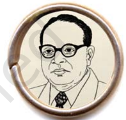
Bhimrao Ramji Ambedkar

(1887-1971) born:Gujarat. Advocate, historian and linguist. Congress leader and Gandhian. Later: Minister in the Union Cabinet. Founder of the Swatantra Party.