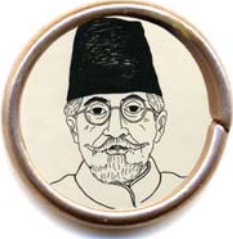
Abul Kalam Azad

The familiarity with political institutions of colonial rule also helped develop an agreement over the institutional design. The British rule had given voting rights only to a few. On that basis the British had introduced very weak legislatures. Elections were held in 1937 to Provincial Legislatures and Ministries all over British India. These were not fully democratic governments. But the experience gained by Indians in the working of the legislative institutions proved to be very useful for the country in setting up its own institutions and