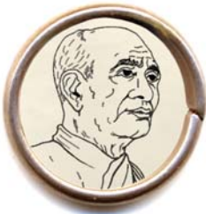
Vallabhbhai Jhaverbhai Patel

(1875-1950) born: Gujarat. Minister of Home, Information and Broadcasting in the Interim Government. Lawyer and leader of Bardoli peasant satyagraha. Played a decisive role in the integration of the Indian princely states. Later: Deputy Prime Minister.