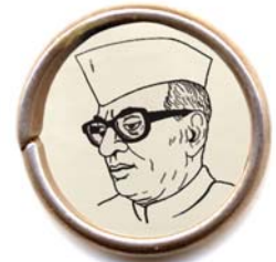
Kanhaiyalal Maniklal Munshi

Constituent Assembly at the stroke of midnight on August 15, 1947: