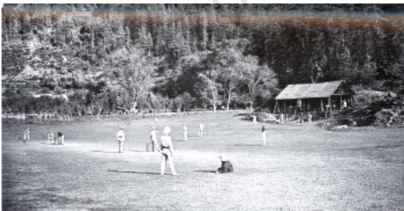
Fig.10 – A leisurely game for recreation, being played against the backdrop of the Himalayas. The only Indians in the picture seem to be the servants seen near the pavilion.