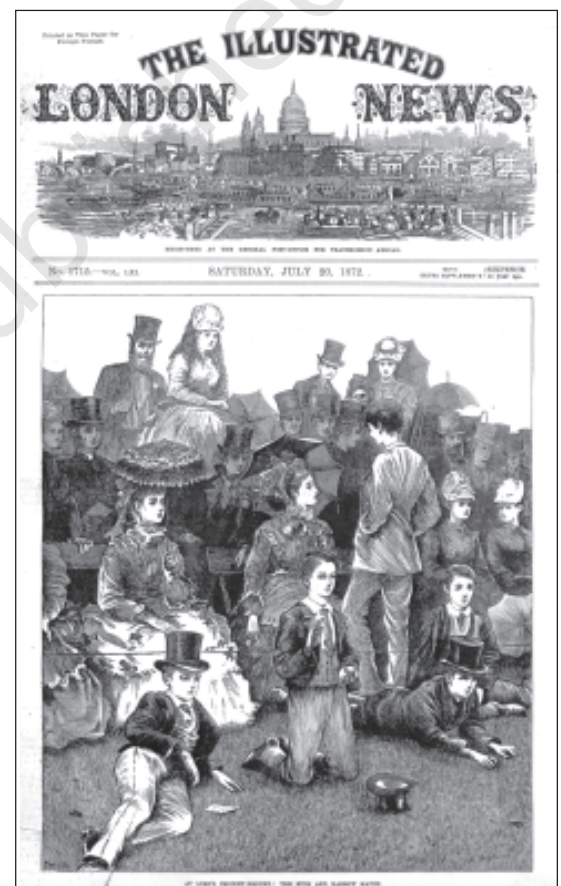
Fig. 7 – A cricket match at Lord's between the famous public schools Eton and Harrow. While the game itself would look similar wherever it is played, the crowd does not. Notice how the upper-class social character of the game is brought out by the focus on gentlemen in bowler hats and ladies with their parasols shading them from the sun. From Illustrated London News, July 20 1872.

Hierarchy – Organised by rank and status