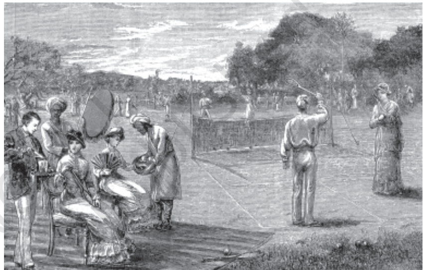
Fig.9 – An afternoon of tennis in the plains of colonial India. Notice how the artist tries to show that the game was for recreation as well as exercise. Men and women could play games together for recreation not competition. From: Graphic, February 1880.

While British imperial officials brought the game to the colonies, they made little effort to spread the game, especially in colonial territories where the subjects of empire were mainly non-white, such as India and the West Indies. Here, playing cricket became a sign of superior social and racial status, and the Afro-Caribbean population was discouraged from participating in organised club cricket, which remained dominated by white plantation owners and their servants. The first non-white club in the West Indies was established towards the end of the nineteenth century, and even in this case its members were light-skinned mulattos . So while black people played an enormous