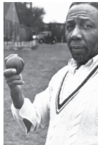
Fig. 12 – Learie Constantine. One of the best-known cricketers of the West Indies.