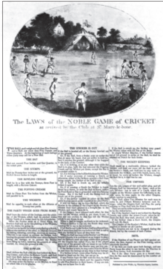
Fig.4 – The laws of cricket drawn up and revised by the MCC were regularly published in this form. Note that norms of betting were also formalised.

In the same way, cricket's vagueness about the size of a cricket ground is a result of its village origins. Cricket was originally played