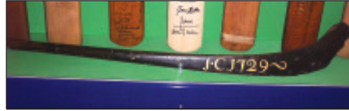
Fig. 1 – The oldest cricket bat in existence. Note the curved end, similar to a hockey stick.

Cricket grew out of the many stick-and-ball games played in England 500 years ago, under a variety of different rules. The word 'bat' is an old English word that simply means stick or club. By the seventeenth century, cricket had evolved enough to be recognisable as a distinct game and it was popular enough for its fans to be fined for playing it on Sunday instead of going to church. Till the middle of the eighteenth century, bats were roughly the same shape as hockey sticks, curving outwards at the bottom. There was a simple reason for this: the ball was bowled underarm, along the ground and the curve at the end of the bat gave the batsman the best chance of making contact.