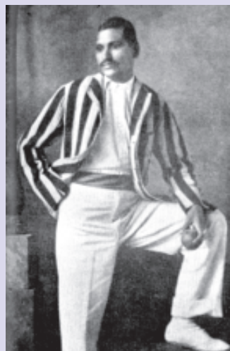
Fig. 14 – Palwankar Baloo (1904).

A Corner of a Foreign Field by Ramachandra Guha.