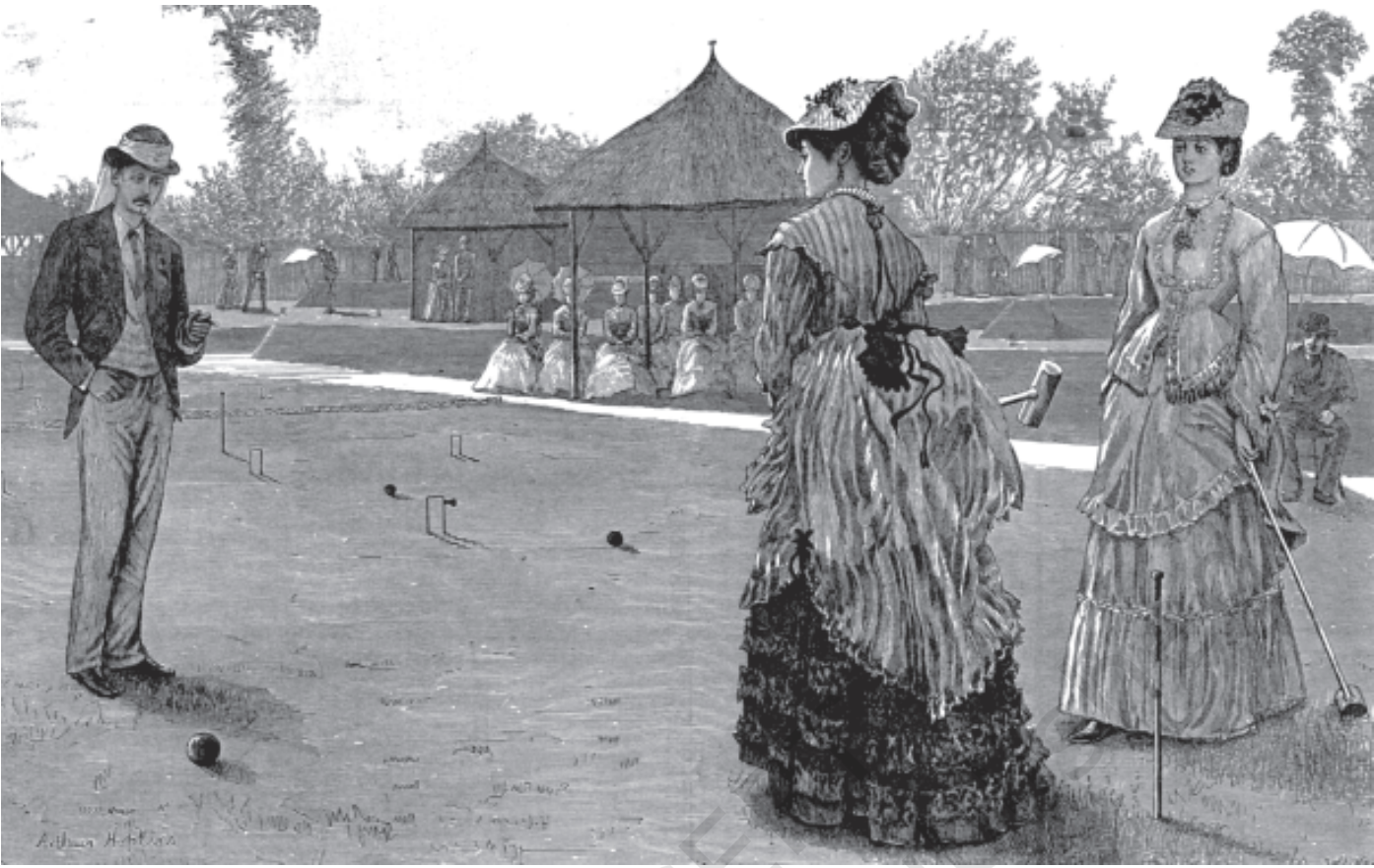
Fig.8 – Croquet, not cricket, for women.

Sports for women was not designed as vigorous, competitive exercise. Croquet was a slow-paced, elegant game considered suitable for women, especially of the upper class. The players' flowing gowns, frills and hats show the character of women's sports. From Illustrated London News, 20 July, 1872.