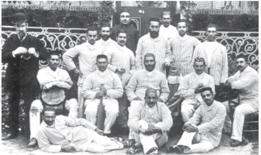
Fig. 13 – The Parsi team, the first Indian cricket team to tour England in 1886.

The origins of Indian cricket, that is, cricket played by Indians are to be found in Bombay and the first Indian community to start playing the game was the small community of Zoroastrians, the Parsis. Brought into close contact with the British because of their interest in trade and the first Indian community to westernise, the Parsis founded the first Indian cricket club, the Oriental Cricket Club in Bombay in 1848. Parsi clubs were funded and sponsored by Parsi businessmen like the Tatas and the Wadias. The white cricket elite in India offered no help to the enthusiastic Parsis. In fact, there was a quarrel between the Bombay Gymkhana, a whites-only club, and Parsi cricketers over the use of a public park. The Parsis complained that the park was left unfit for cricket because the polo ponies of the Bombay Gymkhana dug up the surface. When it became clear that the colonial authorities were prejudiced in favour of their white compatriots, the Parsis built their own gymkhana to play cricket in. The rivalry between the Parsis and the racist Bombay Gymkhana had a happy ending for these pioneers of Indian cricket. A Parsi team beat the Bombay Gymkhana at cricket in 1889, just four years after the foundation of the Indian National Congress in 1885, an organisation that was lucky to have amongst its early leaders the great Parsi statesman and intellectual Dadabhai Naoroji.