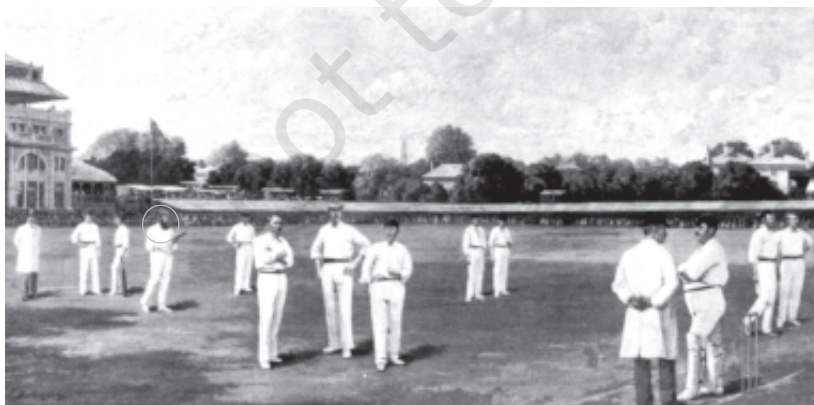
Fig.6 – The legendary batsman W.G. Grace coming out to bat at Lord’s in 1895. He was playing for the Gentlemen against the Players.

But in the matter of protective equipment, cricket has been influenced by technological change. The invention of vulcanised rubber led to the introduction of pads in 1848 and protective gloves soon afterwards, and the modern game would be unimaginable without helmets made out of metal and synthetic lightweight materials.