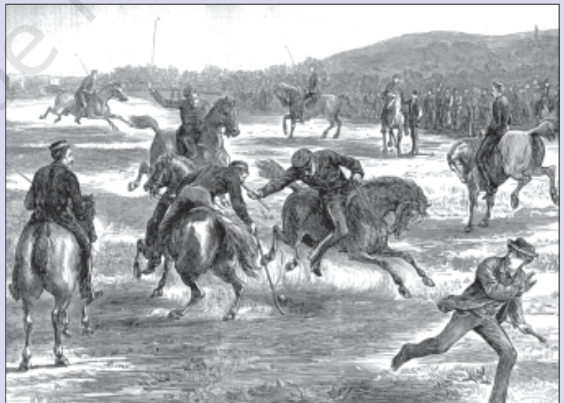
Fig. 15 – Polo Travels West (From: Illustrated London News , 20 July 1872) Polo is a Central Asian game that came to India and was taken west by colonial officials. Sultan Qutubuddin Aibak died in 1210 A.D. when he slipped from his horse playing polo.