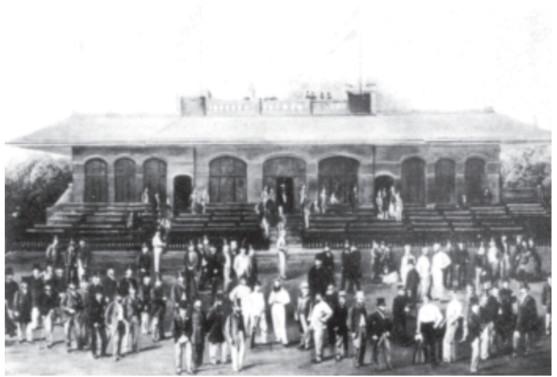
Fig. 3 – The pavilion of the Marylebone Cricket Club (MCC) in 1874.

There's a historical reason behind both these oddities. Cricket was the earliest modern team sport to be codified, which is another way of saying that cricket gave itself rules and regulations so that it could be played in a uniform and standardised way well before team games like soccer and hockey. The first written 'Laws of Cricket' were drawn up in 1744. They stated, 'the principals shall choose from amongst the gentlemen present two umpires who shall absolutely decide all disputes. The stumps must be 22 inches high and the bail across them six inches. The ball must be between 5 and 6 ounces, and the two sets of stumps 22 yards apart'. There were no limits on the shape or size of the bat. It appears that 40 notches or runs was viewed as a very big score, probably due to the bowlers bowling quickly at shins unprotected by pads. The world's first cricket club was formed in Hambledon in the 1760s