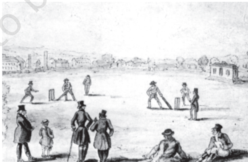
Fig. 2 – An artist's sketch of the cricket ground at Lord's in England in 1821.

Our history of cricket will look first at the evolution of cricket as a game in England, and discuss the wider culture of physical training and athleticism of the time. It will then move to India, discuss the history of the adoption of cricket in this country, and trace the modern transformation of the game. In each of these sections we will see how the history of the game was connected to the social history of the time.