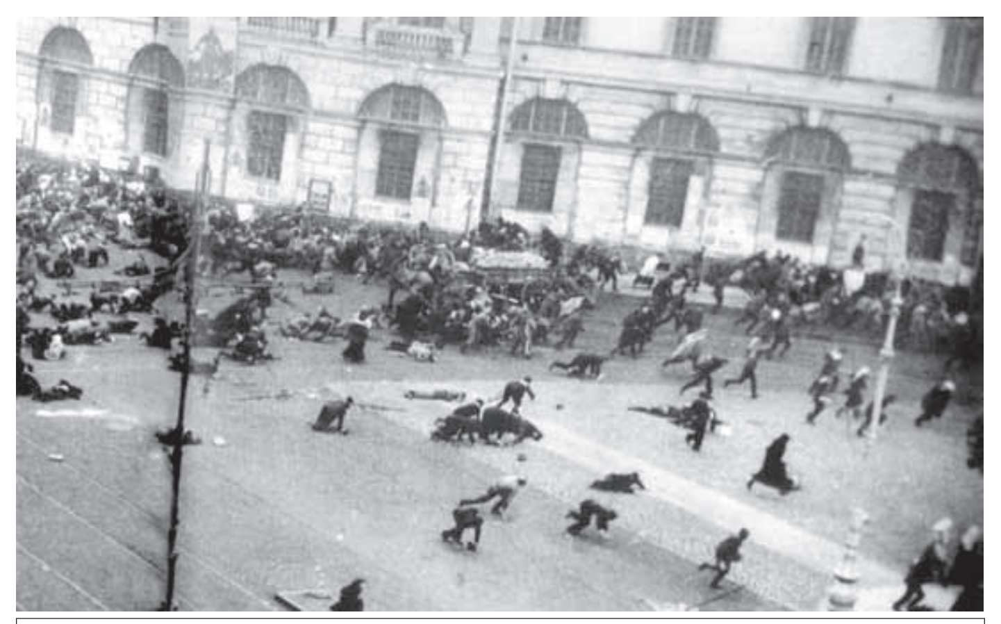
Fig. 10 - The July Days. A pro-Bolshevik demonstration on 17 July 1917 being fired upon by the army.