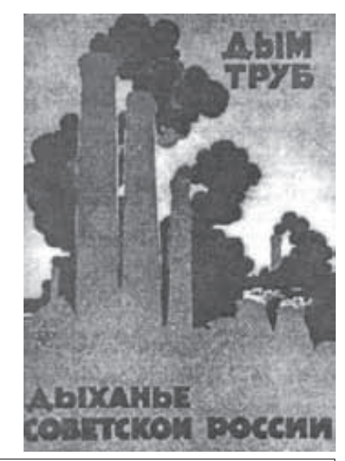
Fig. 14 – Factories came to be seen as a symbol of socialism. This poster states: 'The smoke from the chimneys is the breathing of Soviet Russia.'

An extended schooling system developed, and arrangements were made for factory workers and peasants to enter universities. Crèches were established in factories for the children of women workers. Cheap public health care was provided. Model living quarters were set up for workers. The effect of all this was uneven, though, since government resources were limited.