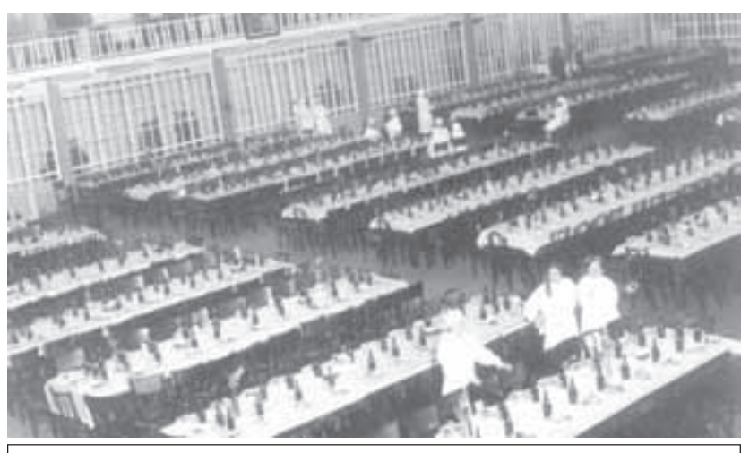
Fig. 17 – Factory dining hall in the 1930s.