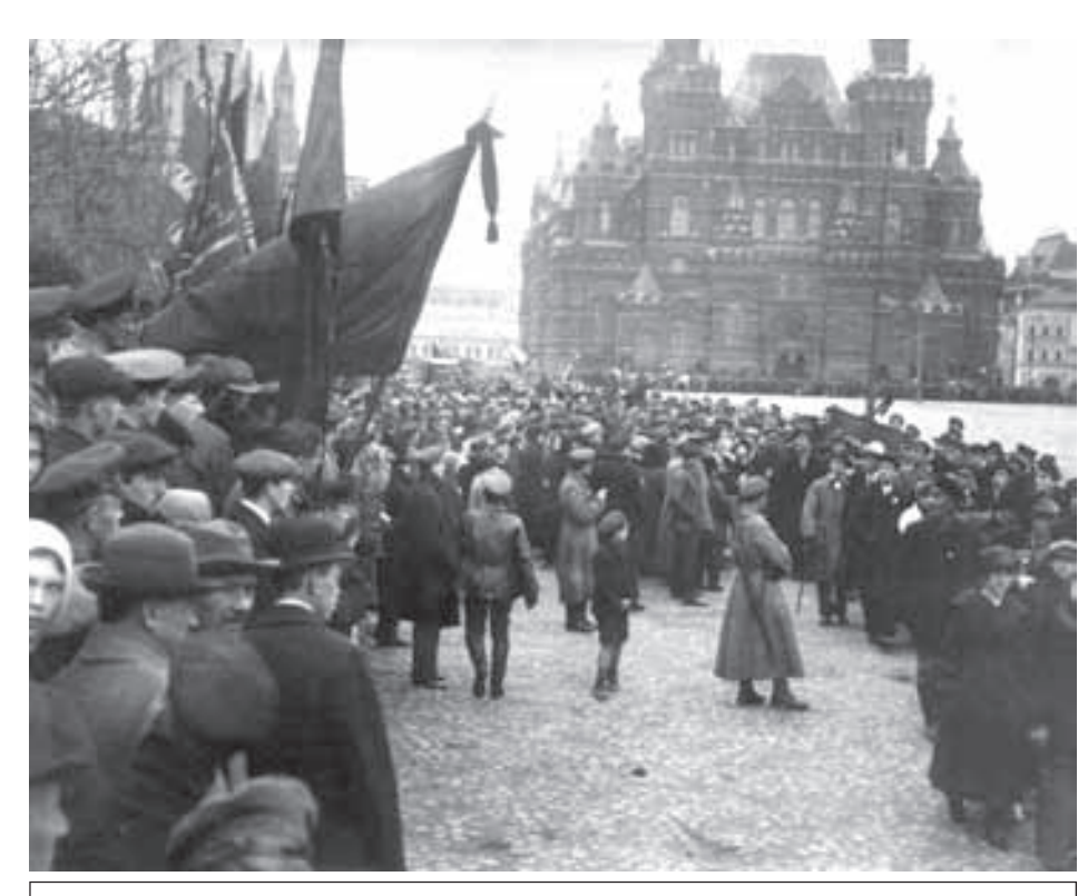
Fig. 13 – May Day demonstration in Moscow in 1918.

at Brest Litovsk. In the years that followed, the Bolsheviks became the only party to participate in the elections to the All Russian Congress of Soviets, which became the Parliament of the country. Russia became a one-party state. Trade unions were kept under party control. The secret police (called the Cheka first, and later OGPU and NKVD) punished criticised those who the Bolsheviks. Many young writers and artists rallied to the Party because it stood for socialism and for change. After October 1917, this led to experiments in the arts and architecture. But many became disillusioned because of the censorship the Party encouraged.