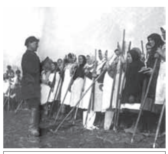
Fig. 19 – Peasant women being gathered to work in the large collective farms.