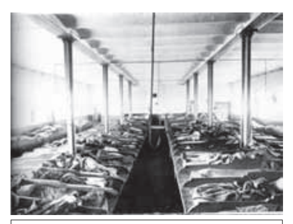
Fig.6 – Workers sleeping in bunkers in a dormitory in pre-revolutionary Russia. They slept in shifts and could not keep their families with them.