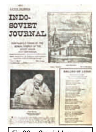
Fig.20 – Special Issue on Lenin of the Indo-Soviet Journal. Indian communists mobilised support for the USSR during the Second World War.