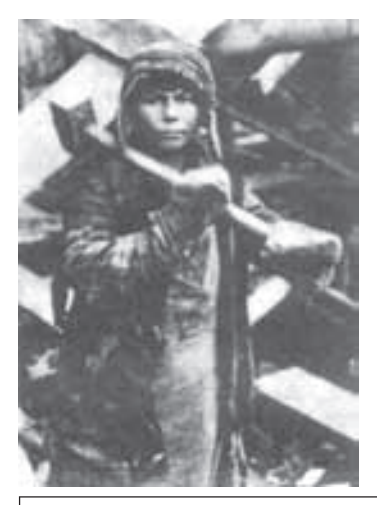
Fig. 16 – A child in Magnitogorsk during the First Five Year Plan. He is working for Soviet Russia.