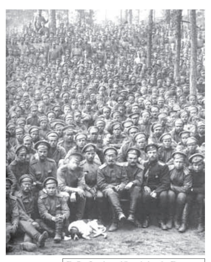
Fig.7 – Russian soldiers during the First World War.

The war also had a severe impact on industry. Russia's own industries were few in number and the country was cut off from other suppliers of industrial goods by German control of the Baltic Sea. Industrial equipment disintegrated more rapidly in Russia than elsewhere in Europe. By 1916, railway lines began to break down. Able-bodied men were called up to the war. As a result, there were labour shortages and small workshops producing essentials were shut down. Large supplies of grain were sent to feed the army. For the people in the cities, bread and flour became scarce. By the winter of 1916, riots at bread shops were common.