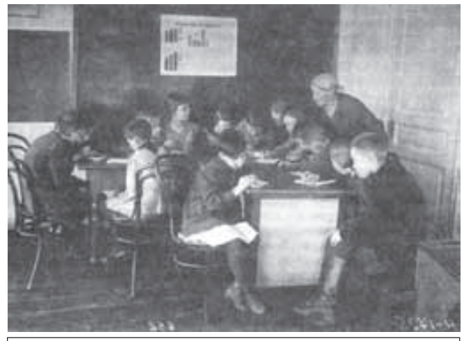
Fig. 15 – Children at school in Soviet Russia in the 1930s. They are studying the Soviet economy.