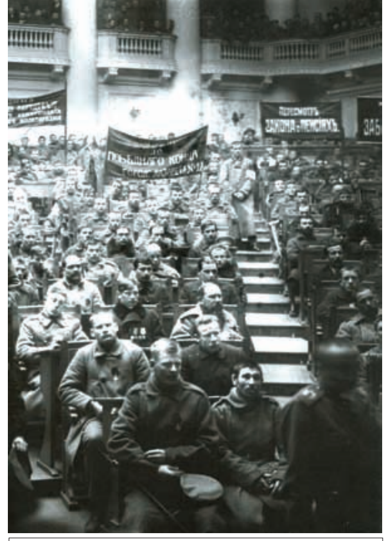
Fig.8 – The Petrograd Soviet meeting in the Duma, February 1917.

On Sunday, 25 February, the government suspended the Duma. Politicians spoke out against the measure. Demonstrators returned in force to the streets of the left bank on the 26th. On the 27th, the Police Headquarters were ransacked. The streets thronged with people raising slogans about bread, wages, better hours and democracy. The government tried to control the situation and called out the cavalry once again. However, the cavalry refused to fire on the demonstrators. An officer was shot at the barracks of a regiment and three other regiments mutinied, voting to join the striking workers. By that evening, soldiers and