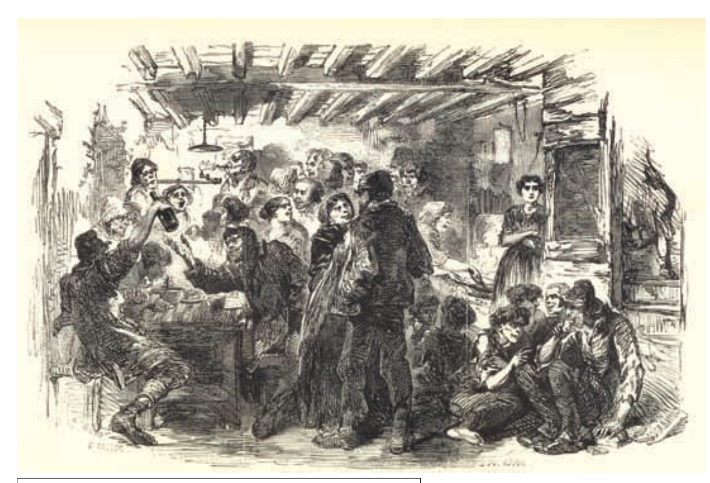
Fig. 1 – The London poor in the mid-nineteenth century as seen by a contemporary. From: Henry Mayhew, London Labour and the London Poor, 1861.

Almost all industries were the property of individuals. Liberals and radicals themselves were often property owners and employers. Having made their wealth through trade or industrial ventures, they felt that such effort should be encouraged – that its benefits would be achieved if the workforce in the economy was healthy and citizens were educated. Opposed to the privileges the old aristocracy had by birth, they firmly believed in the value of individual effort, labour and enterprise. If freedom of individuals was ensured, if the poor could labour, and those with capital could operate without restraint, they believed that societies would develop. Many working men and women who wanted changes in the world rallied around liberal and radical groups and parties in the early nineteenth century.