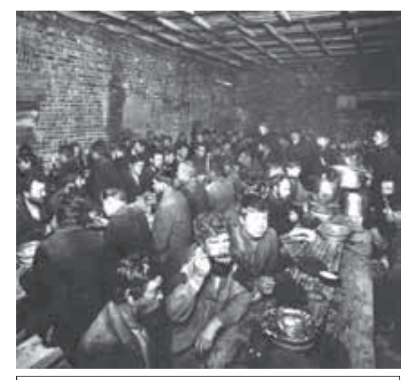
Fig.5 – Unemployed peasants in pre-war St Petersburg. Many survived by eating at charitable kitchens and living in poorhouses.

In the countryside, peasants cultivated most of the land. But the nobility, the crown and the Orthodox Church owned large properties. Like workers, peasants too were divided. They were also