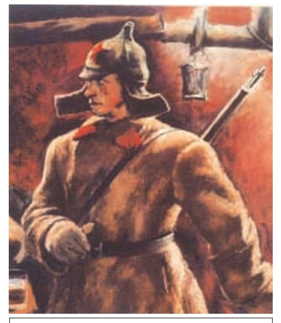
Fig.12 – A soldier wearing the Soviet hat (budeonovka).

The Bolshevik Party was renamed the Russian Communist Party (Bolshevik). In November 1917, the Bolsheviks conducted the elections to the Constituent Assembly, but they failed to gain majority support. In January 1918, the Assembly rejected Bolshevik measures and Lenin dismissed the Assembly. He thought the All Russian Congress of Soviets was more democratic than an assembly elected in uncertain conditions. In March 1918, despite opposition by their political allies, the Bolsheviks made peace with Germany