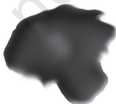
Fig. 5.3: Coal tar

It is a black, thick liquid (Fig. 5.3) with an unpleasant smell. It is a mixture of