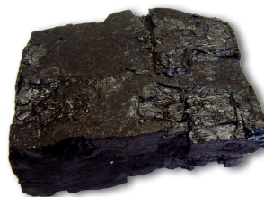
Fig. 5.1: Coal

You may have seen coal or heard about it (Fig. 5.1). It is as hard as stone and is black in colour.