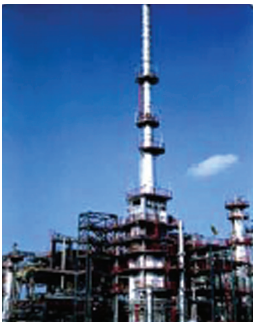
Fig. 5.5: A petroleum refinery

separating the various constituents/fractions of petroleum is known as refining. It is carried out in a petroleum refinery (Fig. 5.5).