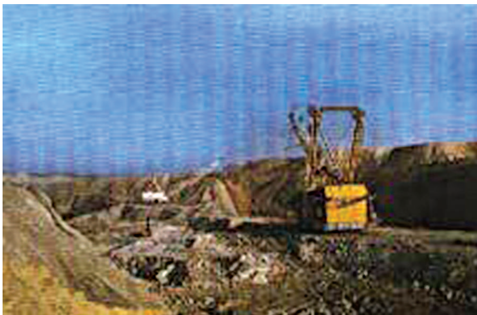
Fig. 5.2: A coal mine

When heated in air, coal burns and produces mainly carbon dioxide gas.