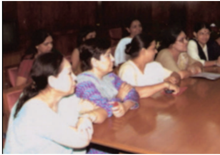
The above photo shows a few women Members of Parliament.

Why do you think there are so few women in Parliament? Discuss.