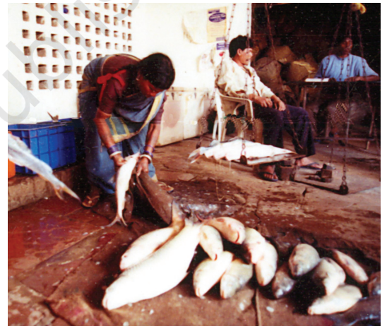
Top: Members of the TMS protesting at a rally. Above: A member of the cooperative weighing the fish.

With the TMS taking over the fishworkers were able to increase their earnings substantially. This was because they set up the cooperative which would buy the catch from them at a fair price. The cooperative would then arrange to transport and sell this in markets where they would get a good price. They have now begun to earn three times more than they earned earlier. The TMS has also begun giving the fishworkers loans for repair and the buying of new nets. By managing to earn a higher wage as well as preserving the fish in the reservoir, the TMS has shown that when people's organisations get their rights to livelihood, they can be good managers.