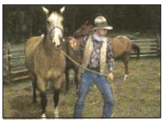
Fig. 9.3: A Cowboy with his horse

Prairies are practically tree-less. Where water is available, trees such as willows, alders and poplars grow. Places that receive rainfall of over 50 cm, are suitable for farming as the soil is fertile. Though the major crop of this area is maize, other crops including potatoes, soybean, cotton and alfa-alfa is also grown. Areas where rainfall is very little or unreliable, grasses are short and sparse. These areas are suitable for cattle rearing. Large cattle farms called ranches are looked after by sturdy men called