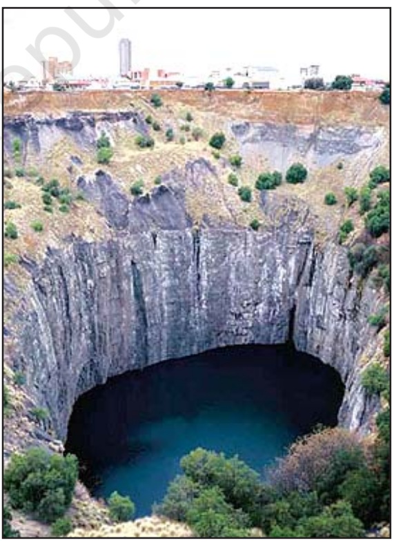
Fig. 9.7: Diamond Mine, Kimberley Life in the Temperate Grasslands 69

The velds have rich reserve of minerals. Iron and steel industry has developed where coal and iron are present. Gold and diamond mining are major occupations of people of this region. Johannesburg is known for being the gold capital of the world. Kimberley is famous for its diamond mines (Fig. 9.7). Mining of diamond and gold in South Africa led to the establishment of trade ties with Britain and gradually South Africa became a British Colony. This mineral rich area has a well-developed network of transport.