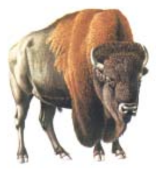
Fig. 9.4: A Bison