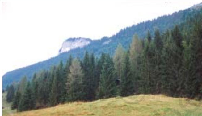
Fig. 6.13 (a): A Coniferous Forest

Taiga means pure or untouched in the Russian language