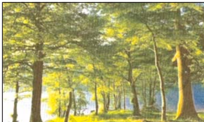
Fig. 6.11: A Temperate Deciduous Forest

As we go towards higher latitudes, there are more temperate deciduous forests (Fig. 6.11). These are found in the north eastern part of USA, China, New Zealand, Chile and also found in the coastal regions of Western Europe. They shed their leaves in the dry season. The common trees are oak, ash, beech, etc. Deer, foxes, wolves are the animals commonly found. Birds like pheasants, monals are also found here (Fig. 6.9 and 6.10).