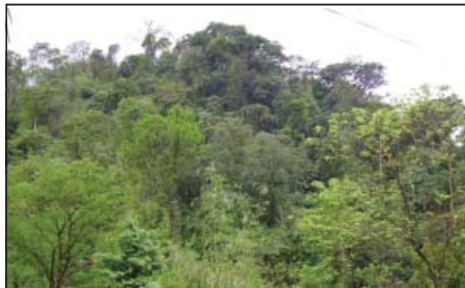
Fig. 6.3: A Tropical Evergreen Forest

Anaconda, one of the world's largest snakes is found in the tropical rainforest. It can kill and eat a large animal such as a crocodile.