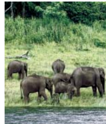
Fig. 6.8: Elephants