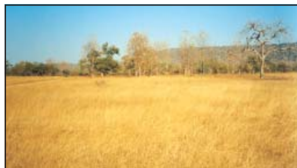
Fig. 6.14: Tropical Grassland

Tropical grasslands: These occur on either side of the equator and extend till the tropics (Fig. 6.14). This vegetation grows in the areas of moderate to low amount of rainfall. The grass can grow very tall, about 3 to 4 metres in height. Savannah grasslands of Africa are of this type. Elephants, zebras, giraffes, deer, leopards are common in tropical grasslands (Fig. 6.15).