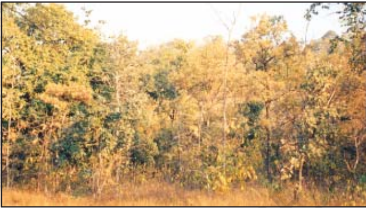
Fig. 6.4: A Tropical Deciduous Forest

Tropical deciduous are the monsoon forests found in the large part of India, northern Australia and in central America (Fig. 6.4). These regions experience seasonal changes. Trees shed their leaves in the dry season to conserve water. The hardwood trees found in these forests are sal, teak, neem and shisham. Hardwood trees are extremely useful for making furniture, transport and constructional materials. Tigers, lions, elephants, langooers and monkeys are the common animals of these regions (Fig. 6.5, 6.6 and 6.8).