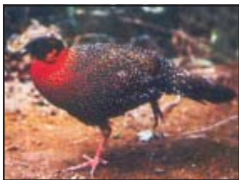
Fig. 6.9: A Pheasant