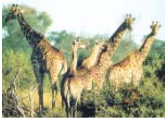
Fig. 6.15: Giraffes