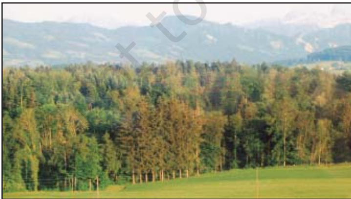
Fig. 6.7: A Temperate Evergreen Forest

The temperate evergreen forests are located in the mid-latitude coastal region (Fig. 6.7). They are commonly found along the eastern margin of the continents, e.g., in south east USA, South China and in South East Brazil. They comprise both hard and soft wood trees like oak, pine, eucalyptus, etc.