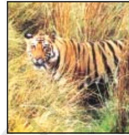
Fig. 6.5: A Tiger