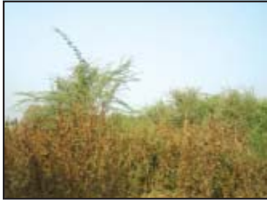
Fig. 6.2: Thorny shrubs