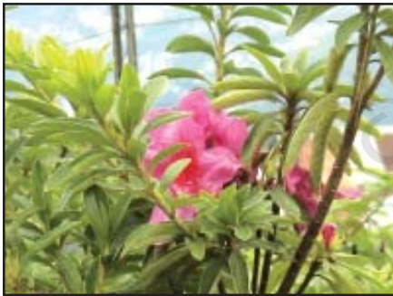
Fig. 6.1: Rhododendron

Salima was excited about the summer camp she was attending. She had gone to visit Manali in Himachal Pradesh along with her class mates. She recalled how surprised she was to see the changes in the landform and natural vegetation as the bus climbed higher and higher. The deep jungles of the foothills comprising sal and teak slowly disappeared. She could see tall trees with thin pointed leaves and cone shaped canopies on the mountain slopes. She learnt that those were coniferous trees. She noticed blooms of bright flowers on tall trees. These were the rhododendrons. From Manali as she was travelling up to Rohtang pass she saw that the land was covered with short grass and snow in some places.