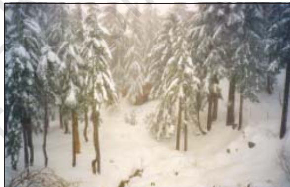
Fig. 6.13 (b): Snow covered Coniferous Forest