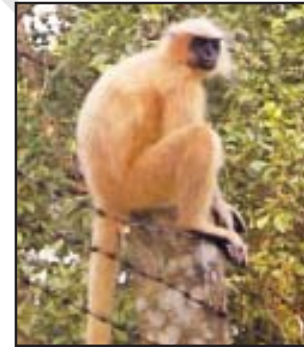
Fig. 6.6: A Golden Langoor