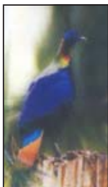
Fig. 6.10: A Monal