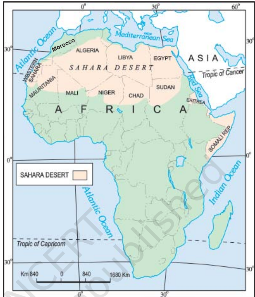
Fig. 10.2: Sahara in Africa

You will be surprised to know that present day Sahara once used to be a lush green plain. Cave paintings in Sahara desert show that there used to be rivers with crocodiles. Elephants, lions, giraffes, ostriches, sheep, cattle and goats were common animals. But the change in climate has changed it to a very hot and dry region.