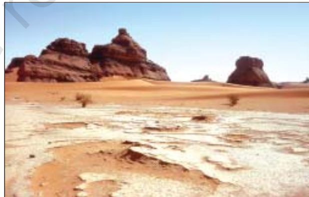
Fig. 10.1: The Sahara Desert

Desert: It is an arid region characterised by extremely high or low temperatures and has scarce vegetation.