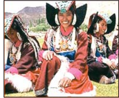
Fig. 10.6. Ladakhi Women in Traditional Dress

Life of people is undergoing change due to modernisation. But the people of Ladakh have over the centuries learned to live in balance and harmony with nature. Due to scarcity of resources like water and fuel, they are used with reverence and care. Nothing is discarded or wasted.