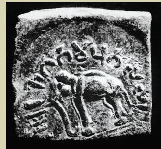
A Satavahana coin

There were other changes that were taking place, in which ordinary men and women played a major role. These included the spread of agriculture and the growth of new towns, craft production and trade. Traders explored land routes within the subcontinent and outside, and sea routes to West Asia, East Africa and South East Asia (see Map 6) were also opened up. And many new buildings were built — including the earliest temples and stupas , books were written, and scientific discoveries were made. These developments took place simultaneously , i.e. at the same time. Keep this in mind as you read the rest of the book.