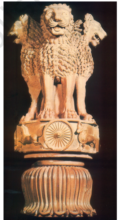
The lion capital

The empire that Ashoka ruled was founded by his grandfather, Chandragupta Maurya, more than 2300 years ago. Chandragupta was supported by a wise man named Chanakya or Kautilya. Many of Chanakya's ideas were written down in a book called the Arthashastra.