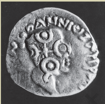
A Shaka coin

The Shakas who ruled over parts of western India fought several battles with the Satavahanas, who ruled over western and parts of central India. The Satavahana kingdom, which was established about 2100 years ago, lasted for about 400 years. Around 1700 years ago, a new ruling family, known as the Vakatakas, became powerful in central and western India.