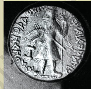
A Kushana coin

In the north, and in parts of central India, a general of the Mauryas, named Pushyamitra Shunga, set up a kingdom. The Shungas were followed by another dynasty, known as the Kanvas, and by rulers from other families till the establishment of the Gupta empire about 1700 years ago.