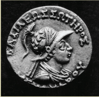
An Indo-Greek coin

The Mauryan empire collapsed about 2200 years ago. In its place (and elsewhere) rose several new kingdoms. In the north-west, and in parts of north India, kings known as the Indo-Greeks ruled for about one hundred years. They were followed