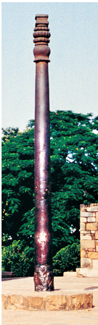
The iron pillar

The iron pillar at Mehrauli, Delhi, is a remarkable example of the skill of Indian crafts persons. It is made of iron, 7.2. m high, and weighs over 3 tonnes. It was made about 1500 years ago. We know the date because there is an inscription on the pillar mentioning a ruler named Chandra, who probably belonged to the Gupta dynasty (Chapter 11). What is amazing is the fact that the pillar has not rusted in all these years.