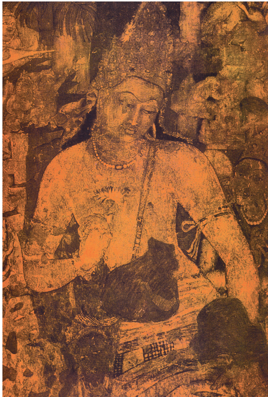
Paintings from Ajanta. Describe what you see in each of these paintings.

women who are known only by their names which were inscribed on pillars, railings and walls. So when you get a chance to visit any of these buildings, remember how several hundreds of people probably worked to construct and decorate them.