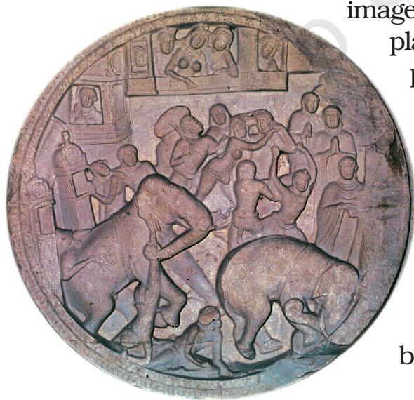
Left : Sculpture from Amaravati. Look at the picture and describe what you see.