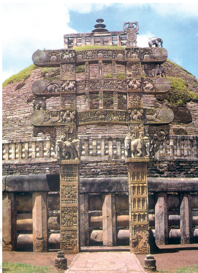
Top : The Great Stupa at Sanchi, Madhya Pradesh. Stupas like this one were built over several centuries. While the brick mound probably dates to the time of Ashoka (Chapter 8), the railings and gateways were added during the time of later rulers.

Often, as at Bhitargaon, a tower, known as the shikhara , was built on top of the