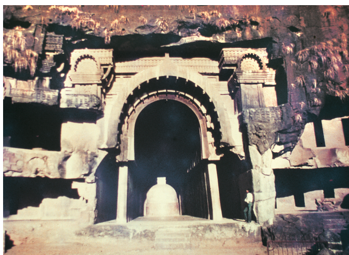
A cave at Karle, Maharashtra

Read page 100 once more. Can you think of how Buddhism spread to these lands?