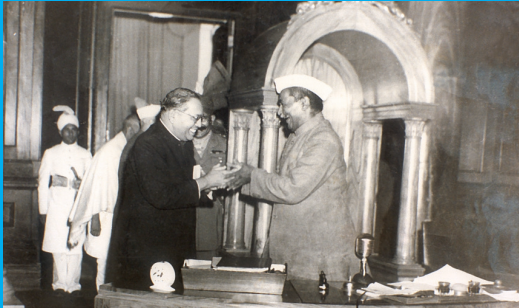
The President of the Constituent Assembly, Dr. Rajendra Prasad and the Chairman of the Drafting Committee, Dr. B.R. Ambedkar greeting each other

Constituent Assembly, where each clause of the Constitution was subjected to scrutiny and debate, is a tribute to public reason at its best. These debates deserved to be memorialised as one of the most significant chapters in the history of constitution making, equal in importance to the French and American revolutions.