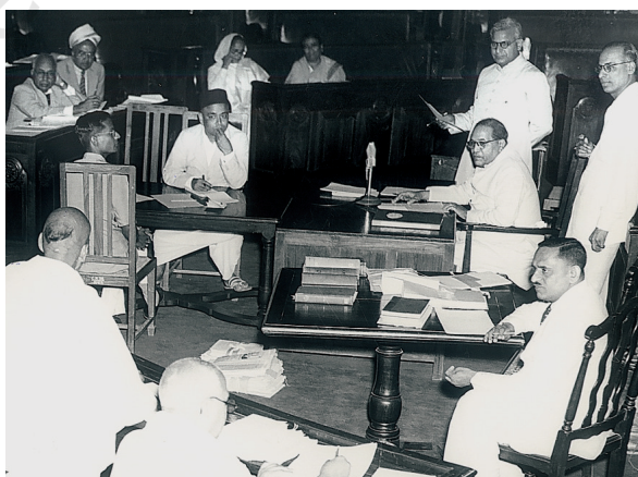
Dr. B.R. Ambedkar presiding over a discussion in the Constituent Assembly

Dr. B.R. Ambedkar CAD, Vol. VII, p.37, 4 November 1948