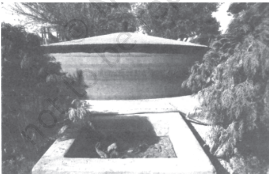
Fig.9.4 Gobar Gas Plant uses cattle dung to produce energy

Wind Power: In areas where speed of wind is usually high, wind mills can provide electricity without any adverse impact on the environment. Wind turbines move with the wind and electricity is generated. No doubt, the initial cost is high. But the benefits are such that the high cost gets easily absorbed.