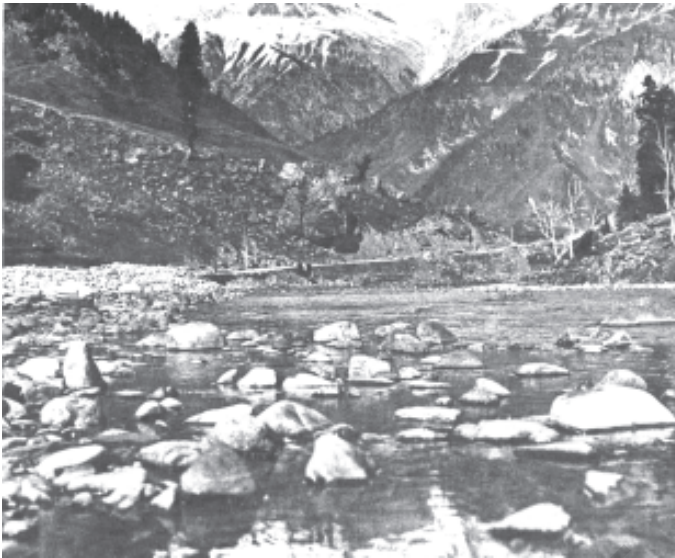
Fig. 9.1 Water bodies: small, snow-fed Himalayan streams are the few fresh-water sources that remain unpolluted.

this results in an environmental crisis. This is the situation today all over the world. The rising population of the developing countries and the affluent consumption and production standards of the developed world have placed a huge stress on the environment in terms of its first two functions. Many resources have become extinct and the wastes generated are beyond the absorptive capacity of the environment. Absorptive capacity means the ability of the environment to