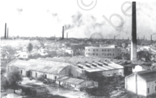
Fig. 9.2 Damodar Valley is one of India's most industrialised regions. Pollutants from the heavy industries along the banks of the Damodar river are converting it into an ecological disaster

But with population explosion and with the advent of industrial revolution to meet the growing needs of the expanding population, things changed. The result was that the demand for resources for both production and consumption went beyond the rate of regeneration of the resources; the pressure on the absorptive capacity of the environment increased tremendously — this trend continues even today. Thus what has happened is a reversal of supply-demand relationship for environmental quality — we are now faced with increased demand for environmental resources and services but their supply is limited due to overuse