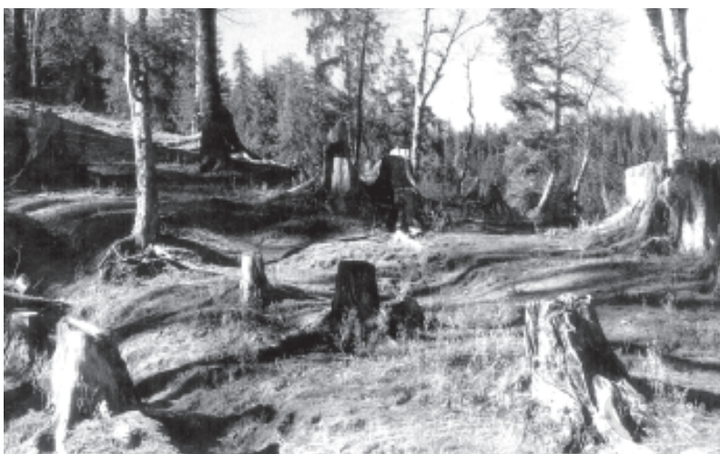
Fig. 9.3 Deforestation leads to land degradation, biodiversity loss and air pollution

India has abundant natural resources in terms of rich quality of soil, hundreds of rivers and tributaries, lush green forests, plenty of mineral deposits beneath the land surface, vast stretch of the Indian Ocean, ranges of mountains, etc. The black soil of the Deccan Plateau is particularly suitable for cultivation of cotton, leading to concentration of textile industries in this region. The Indo-Gangetic plains — spread from the Arabian Sea to the Bay of Bengal — are one of the most fertile, intensively cultivated and densely populated regions in the world. India's forests, though unevenly distributed, provide green cover for a majority of its population and natural cover for its wildlife. Large deposits of iron-ore, coal and natural gas are found in the country. India alone accounts for nearly 20 per cent of the world's total iron-ore reserves. Bauxite, copper, chromate, diamonds, gold, lead, lignite, manganese, zinc, uranium, etc. are also available in different parts of the country. However, the developmental activities in India have resulted in