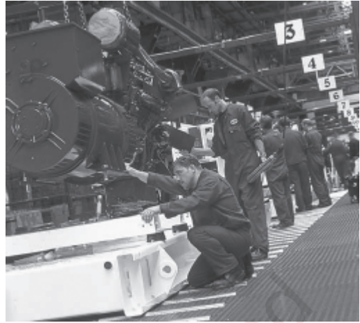
Fig. 5.3 Scientific and technical manpower: a rich ingredient of human capital

Empirical evidence to prove that increase in human capital causes economic growth is rather nebulous. This may be because of measurement problems. For example, education measured in terms of years of schooling, teacher-pupil ratio and enrolment rates may not reflect the quality of education; health services measured in monetary terms, life expectancy and mortality rates may not reflect the true health status of the people in a country. Using the indicators mentioned above, an analysis of improvement in education and health sectors and growth in real per capita income in both developing and developed countries shows that there is convergence in the measures of human capital but no sign of convergence of per capita real income. In other words, the human capital growth in developing countries has been faster but the growth of per capita real income has not been that fast. There are reasons to believe that the