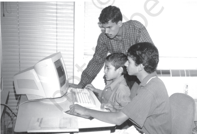
Fig. 5.4 Job on hand: transforming India into a knowledge economy

World Bank, in its recent report, 'India and the Knowledge Economy — Leveraging Strengths and Opportunities', states that India should make a transition to the knowledge economy and if it uses its knowledge as much as Ireland does (it is judged that Ireland uses its knowledge economy very effectively), then the per capita income of India will increase from a little over US $1000 in