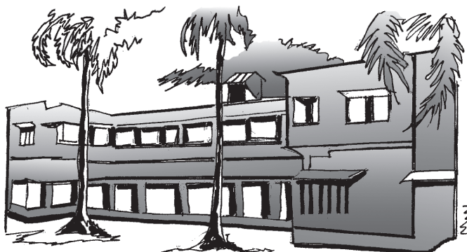
Fig. 5.5 Investment in educational infrastructure is inevitable

Pradesh to as low as Rs 4088 in Bihar. This leads to differences in educational opportunities and attainments across states.