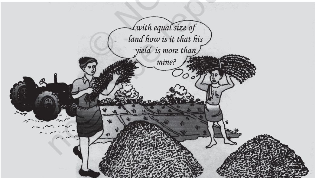
Fig. 5.1 Adequate education and training to farmers can raise productivity in farms

Education is sought not only as it confers higher earning capacity on people but also for its other highly valued benefits: it gives one a better social standing and pride; it enables one to make better choices in life; it provides knowledge to understand the changes taking place in society; it also stimulates innovations. Moreover, the availability of educated labour force facilitates adaptation of new