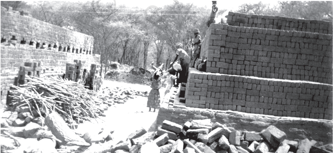
Fig. 5.6 School dropouts give way to child labour: a loss to human capital

Education for All — Still a Distant Dream: Though literacy rates for both — adults as well as youth — have increased, still the absolute number of illiterates in India is as much as India’s population was at the time of independence. In 1950, when the Constitution of India was passed by the Constituent Assembly, it was noted in