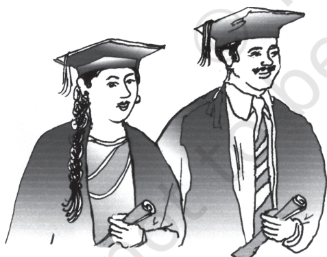
Fig. 5.7 Higher Education: few takers

The differences in literacy rates between males and females are narrowing signifying a positive development in gender equity; still the need to promote education for women in India is imminent for various reasons such as improving economic independence and social status of women and also because women education makes a favourable impact on fertility rate and health care of women and children. Therefore, we cannot be complacent about the upward movement in the literacy rates and we have miles to go in achieving cent per cent adult literacy.