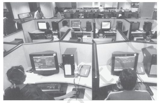
Fig. 3.2 IT Industry is seen as a major contributor to India's exports

Some scholars question the usefulness of India being a member of the WTO as a major volume of international trade occurs among the developed nations. They also say that while developed countries file complaints over agricultural subsidies given in their countries, developing countries feel cheated as they are forced to open up their markets for developed countries but are not allowed access to the markets of developed countries. What do you think?