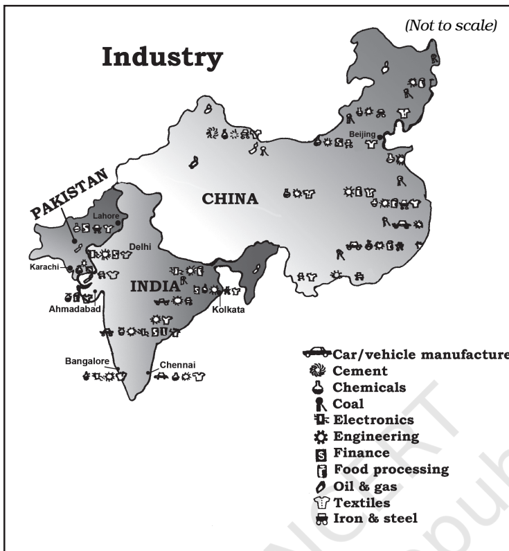
Fig. 10.3 Industry in India, China and Pakistan.

due to topographic and climatic conditions, the area suitable for cultivation is relatively small — only about 10 per cent of its total land area. The total cultivable area in China accounts for 40 per cent of the cultivable area in India. Until the 1980s, more than 80 per cent of the people in China were dependent on farming as their sole source of livelihood. Since then, the government encouraged people to leave their fields and pursue other activities such as handicrafts, commerce and transport. In 2013, with 28 per cent of its workforce engaged in agriculture, its contribution to GDP in China is 9 per cent (see Table 10.3).