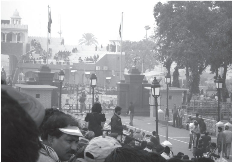
Fig. 10.1 Wagah Border is not only a tourist place but also used for trade between India and Pakistan

goods. At this stage, enterprises owned by government (known as State Owned Enterprises—SOEs), which we, in India, call public sector enterprises, were made to face competition. The reform process also involved dual pricing. This means fixing the prices in two ways; farmers and industrial units were required to buy and sell fixed quantities of inputs and outputs on the basis of prices fixed by the government and the rest were purchased and sold at market prices. Over the years, as production increased, the proportion of goods or inputs transacted in the market also increased. In order to attract foreign investors, special economic zones were set up.