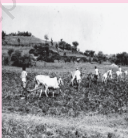
Fig. 1.1 India's agricultural stagnation under the British colonial rule

The French traveller, Bernier, described seventeenth century Bengal in the following way: "The knowledge I have acquired of Bengal in two visits inclines me to believe that it is richer than Egypt. It exports, in abundance, cottons and silks, rice, sugar and butter. It produces amply — for its own consumption — wheat, vegetables, grains, fowls, ducks and geese. It has immense herds of pigs and flocks of sheep and goats. Fish of every kind it has in profusion. From rajmahal to the sea is an endless number of canals, cut in bygone ages from the Ganges by immense labour for navigation and irrigation."