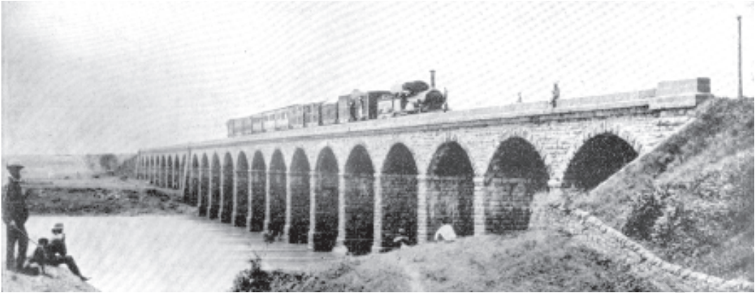
Fig. 1.4 First Railway Bridge linking Bombay with Thane, 1854

Indian people gained owing to the introduction of the railways, were thus outweighed by the country's huge economic loss.