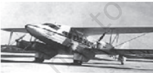
Fig.1.5 Tata Airlines, a division of Tata and Sons, was established in 1932 inaugurating the aviation sector in India

cost to the government exchequer, yet, it failed to compete with the railways, which soon traversed the region running parallel to the canal, and had to be ultimately abandoned. The introduction of the expensive system of electric telegraph in India, similarly, served the purpose of maintaining law and order. The postal services, on the other hand, despite serving a useful public purpose, remained all through