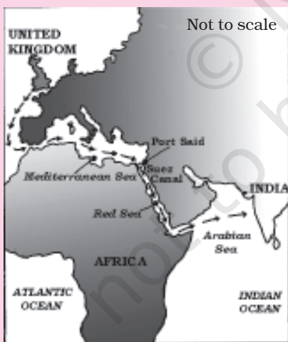
Fig.1.2 Suez Canal: Used as highway between India and Britain

Various details about the population of British India were first collected through a census in 1881. Though suffering from certain limitations, it revealed the unevenness in India's population growth. Subsequently,