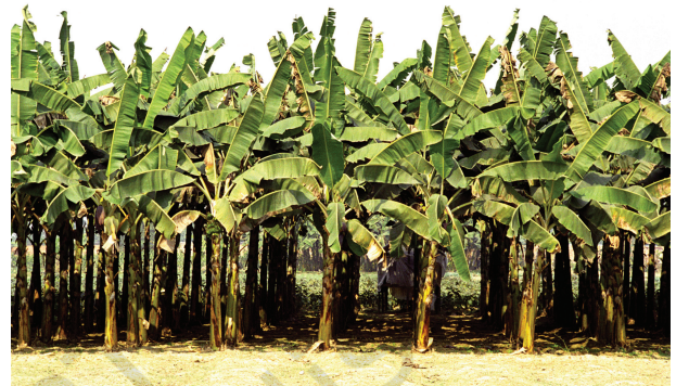
Fig. 4.2: Banana plantation in Southern part of India

In India, tea, coffee, rubber, sugarcane, banana, etc.. are important plantation crops. Tea in Assam and North Bengal coffee in