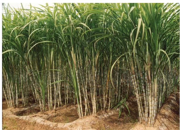
Fig. 4.8: Sugarcane Cultivation

Sugarcane: It is a tropical as well as a subtropical crop. It grows well in hot and humid climate with a temperature of 21°C to 27°C and an annual rainfall between 75cm. and 100cm. Irrigation is required in the regions of low rainfall. It can be grown on a variety of