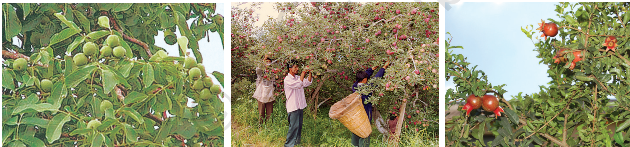
Fig. 4.12: Apricots, apple and pomegranate

tropical as well as temperate fruits. Mangoes of Maharashtra, Andhra Pradesh, Telangana, Uttar Pradesh and West Bengal, oranges of Nagpur and Cherrapunjee (Meghalaya), bananas of Kerala, Mizoram, Maharashtra and Tamil Nadu, lichi and guava of Uttar Pradesh and Bihar, pineapples of Meghalaya, grapes of Andhra Pradesh, Telangana and Maharashtra, apples, pears, apricots and walnuts of Jammu and Kashmir and Himachal Pradesh are in great demand the world over.