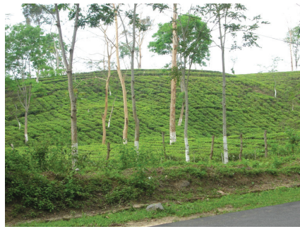
Fig. 4.10: Tea Cultivation

Coffee: In 2008 India produced 3.2 per cent of the world coffee production. Indian coffee is known in the world for its good quality. The Arabica variety initially brought from Yemen is produced in the country. This variety is in great demand all over the world. Initially its cultivation was introduced on the Baba Budan Hills and even today its cultivation is confined to the Nilgiri in Karnataka, Kerala and Tamil Nadu.