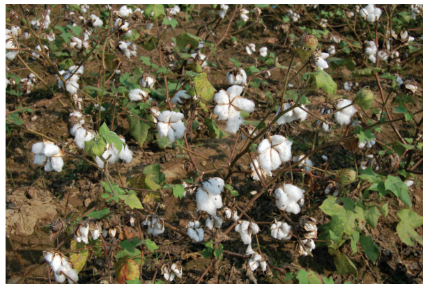
Fig. 4.15: Cotton Cultivation

Cotton: India is believed to be the original home of the cotton plant. Cotton is one of the main raw materials for cotton textile industry. In 2008 India was second largest producer of cotton after China. Cotton grows well in drier parts of the black cotton soil of the Deccan