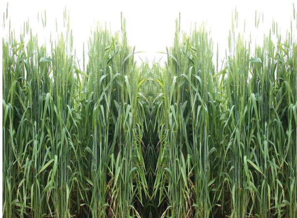
Fig. 4.5: Wheat Cultivation

Wheat: This is the second most important cereal crop. It is the main food crop, in north and north-western part of the country. This rabi crop requires a cool growing season and a bright sunshine at the time of ripening. It requires 50 to 75 cm of annual rainfall evenly-distributed over the growing season. There are two important wheat-growing zones in the country – the Ganga-Satluj plains in the north-west and black soil region of the Deccan. The major wheat-producing states are Punjab, Haryana, Uttar Pradesh, Bihar, Rajasthan and parts of Madhya Pradesh.