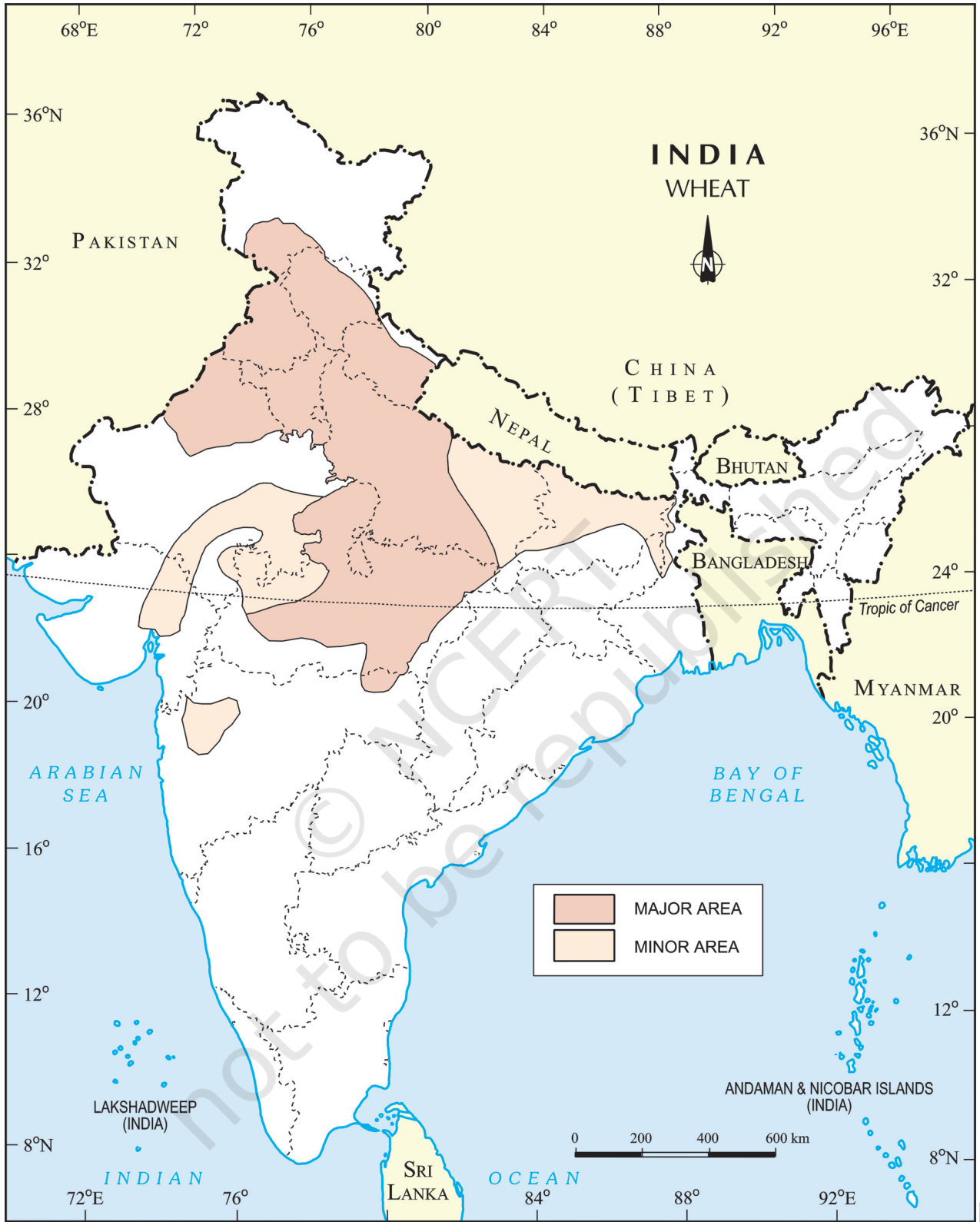
India: Distribution of Wheat