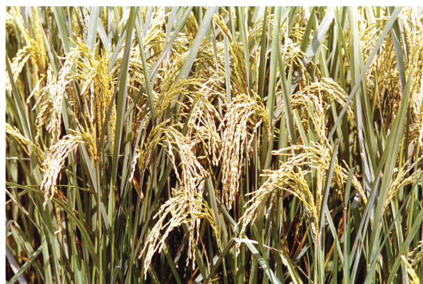
Fig. 4.4 (b): Rice is ready to be harvested in the field