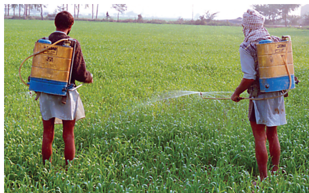
Fig. 4.18: Problems associated with heavy pesticide use are widely recognised in developed and developing countries

Can you name any gene modified seed used vastly in India?