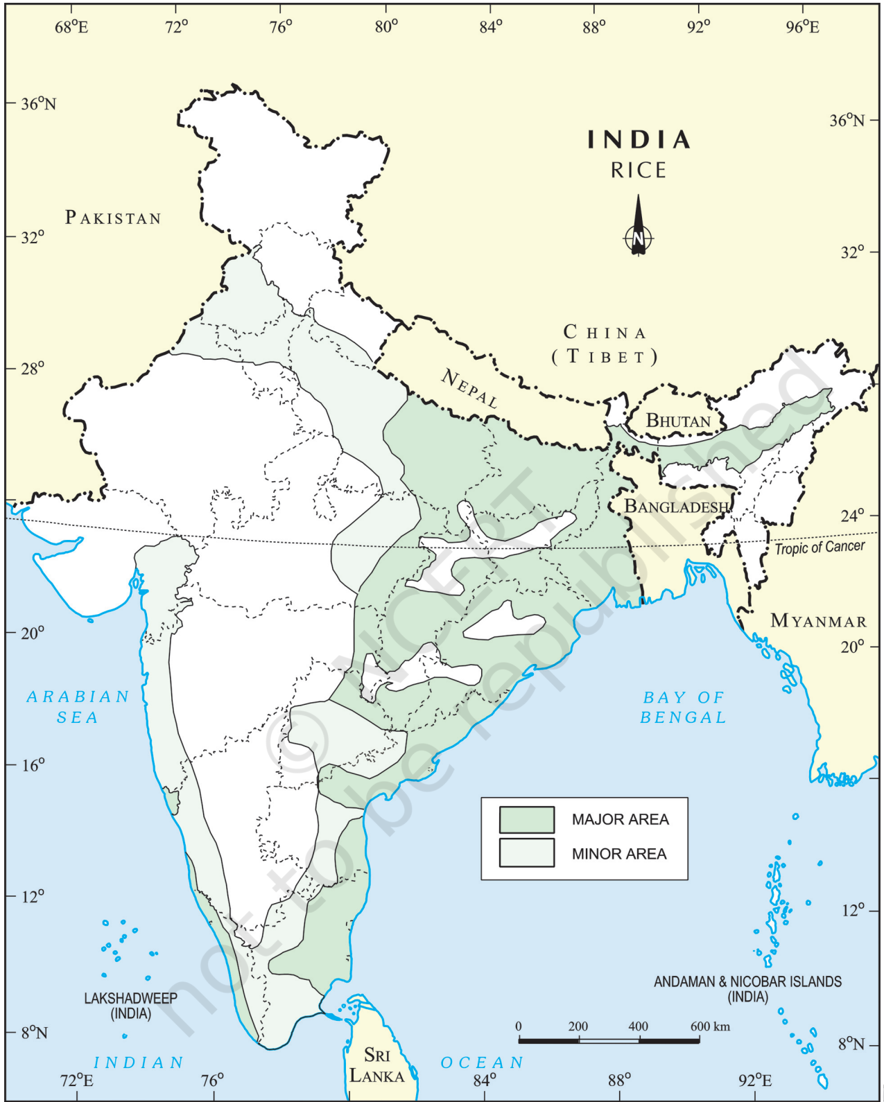
India: Distribution of Rice