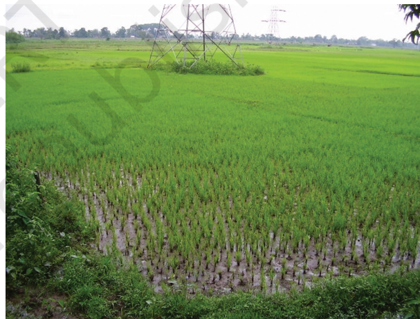
Fig. 4.4 (a): Rice Cultivation

Rice is grown in the plains of north and north-eastern India, coastal areas and the deltaic regions. Development of dense network