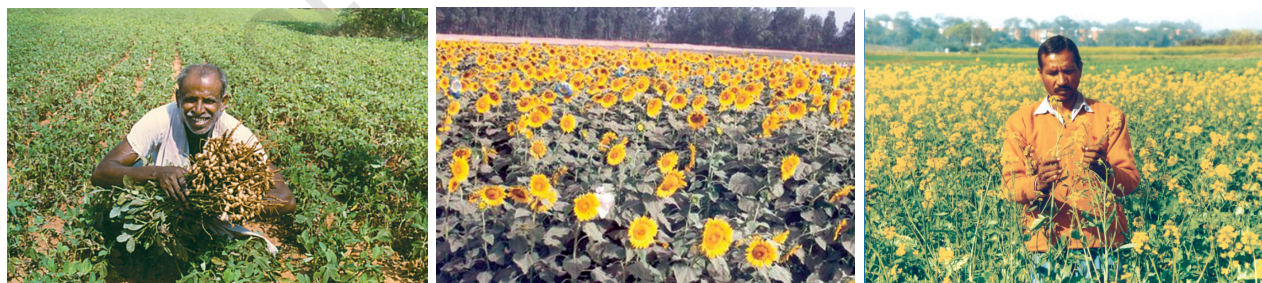
Fig. 4.9: Groundnut, sunflower and mustard are ready to be harvested in the field

Tea: Tea cultivation is an example of plantation agriculture. It is also an important beverage crop introduced in India initially by the British. Today, most of the tea plantations are owned by Indians. The tea plant grows well in tropical and sub-tropical climates endowed with deep and fertile well-drained soil, rich in humus and organic matter. Tea bushes require warm and moist frost-free climate all through the year. Frequent showers evenly distributed over the year ensure continuous growth of tender leaves. Tea is a labour-intensive industry. It requires abundant,