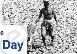
Percentage of households indebted in '91-92: 29%

Deaths Keeping Pace With Rising Indebtedness