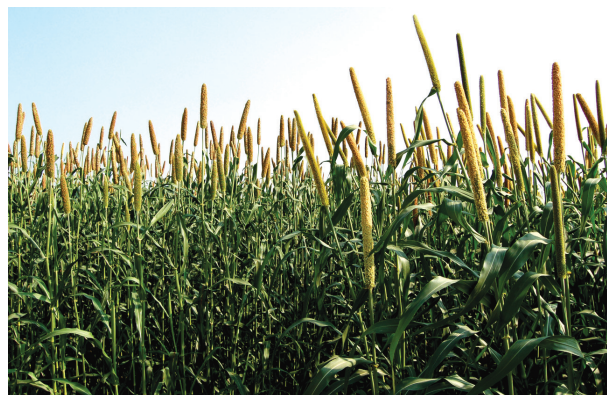
Fig. 4.6: Bajra Cultivation

Bajra grows well on sandy soils and shallow black soil. Major Bajra producing States were: Rajasthan, Uttar Pradesh, Maharashtra, Gujarat and Haryana in 2011-12. Ragi is a