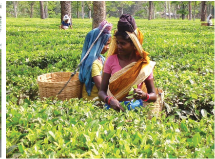
Fig. 4.11: Tea-leaves Harvesting

tropical as well as temperate fruits. Mangoes of Maharashtra, Andhra Pradesh, Telangana, Uttar Pradesh and West Bengal, oranges of Nagpur and Cherrapunjee (Meghalaya), bananas of Kerala, Mizoram, Maharashtra and Tamil Nadu, lichi and guava of Uttar Pradesh and Bihar, pineapples of Meghalaya, grapes of Andhra Pradesh, Telangana and Maharashtra, apples, pears, apricots and walnuts of Jammu and Kashmir and Himachal Pradesh are in great demand the world over.