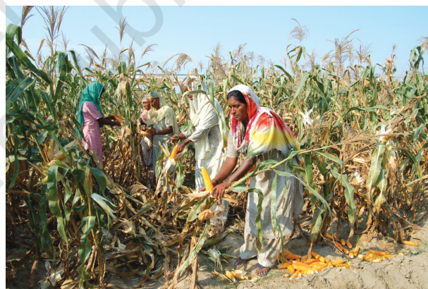
Fig. 4.7: Maize Cultivation

Maize: It is a crop which is used both as food and fodder. It is a kharif crop which requires temperature between 21°C to 27°C and grows well in old alluvial soil. In some states like Bihar