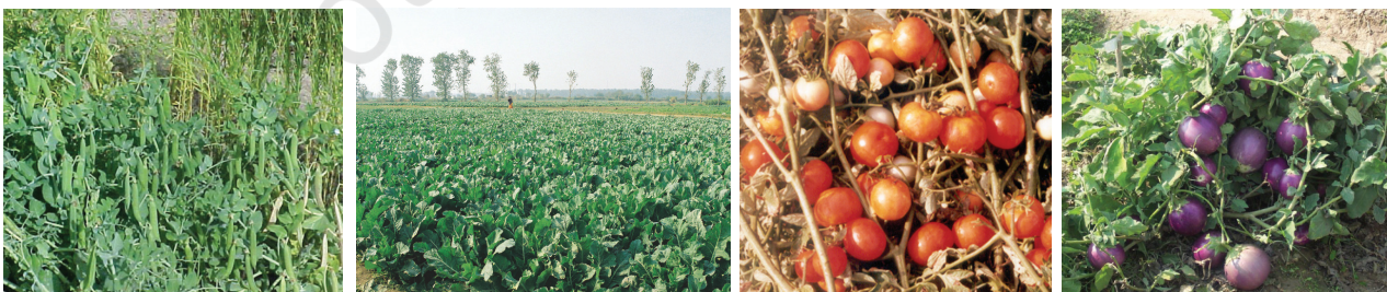
Fig. 4.13: Cultivation of vegetables – peas, cauliflower, tomato and brinjal

India produces about 13 per cent of the world's vegetables. It is an important producer of pea, cauliflower, onion, cabbage, tomato, brinjal and potato.