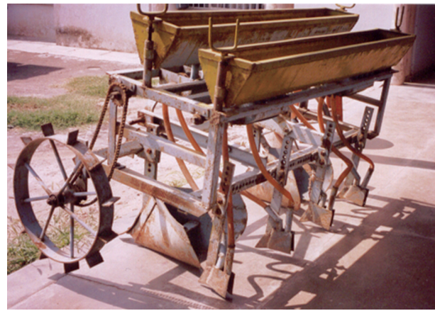
Fig. 4.16: Modern technological equipments used in agriculture

institutional reforms. Thus, collectivisation, consolidation of holdings, cooperation and abolition of zamindari, etc. were given priority to bring about institutional reforms in the country after Independence. 'Land reform' was the main focus of our First Five Year Plan. The right of inheritance had already led to fragmentation of land holdings necessitating consolidation of holdings.