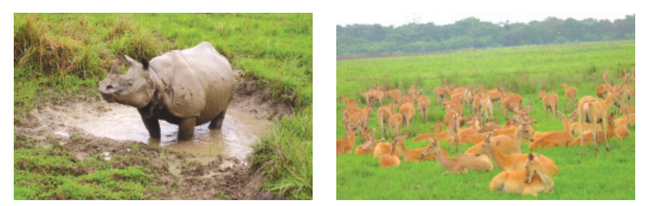
Fig. 2.4: Rhino and deer in Kaziranga National Park

horned rhinoceros, the Kashmir stag or hangul, three types of crocodiles – fresh water crocodile, saltwater crocodile and the Gharial , the Asiatic lion, and others. Most recently, the Indian elephant, black buck (chinkara), the great Indian bustard ( godawan ) and the snow leopard, etc. have been given full or partial legal protection against hunting and trade throughout India.