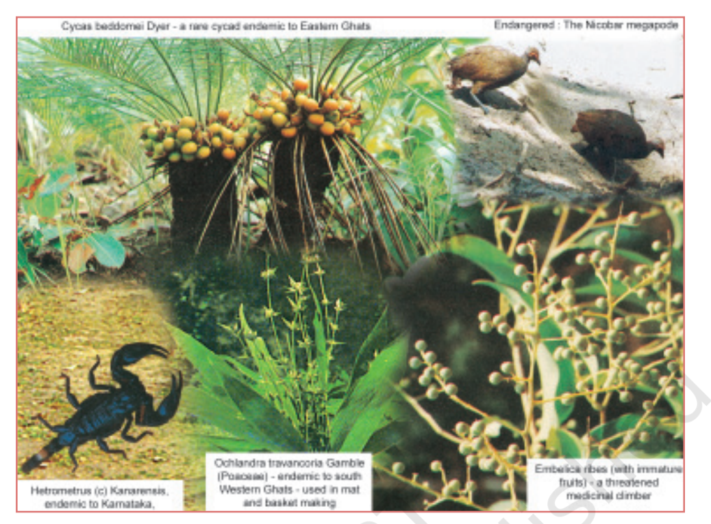
Fig. 2.2: A few extinct, rare and endangered species

Asiatic Cheetah: where did they go? The world's fastest land mammal, the cheetah (Acinonyx jubantus), is a unique and specialised member of the cat family and can move at the speed of 112 km./hr. The cheetah is often mistaken for a leopard. Its distinguishing marks are the long teardropshaped lines on each side of the nose from the corner of its eyes to its mouth. Prior to the 20th century, cheetahs were widely distributed throughout Africa and Asia. Today, the Asian cheetah is nearly extinct due to a decline of available habitat and prey. The species was declared extinct in India long back in 1952.