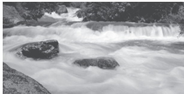
Figure 3.3 : Rapids

The Himalayan drainage system has evolved through a long geological history. It mainly includes the Ganga, the Indus and the Brahmaputra river basins. Since these are fed both by melting of snow and precipitation, rivers of this system are perennial. These rivers pass through the giant gorges carved out by the erosional activity carried on simultaneously with the uplift of the Himalayas. Besides deep gorges, these rivers also form V-shaped valleys, rapids and waterfalls in their mountainous