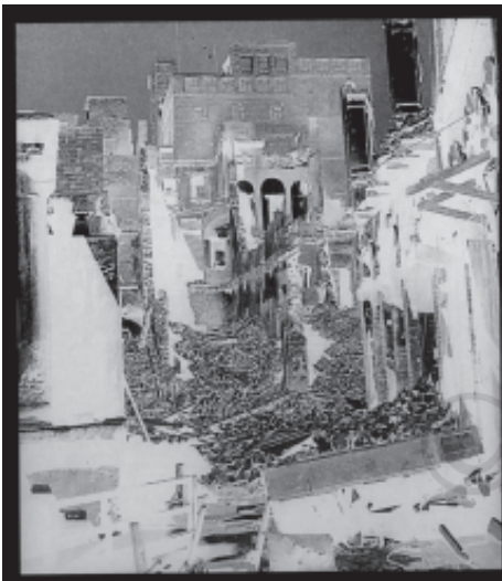
Fig. 15.2 Images of desolation and destruction continued to haunt members of the Constituent Assembly.

From your political science textbooks you know what the Constitution of India is, and you have seen how it has worked over the decades since Independence. This chapter will introduce you to the history that lies behind the Constitution, and the intense debates that were part of its making. If we try and hear the voices within the Constituent Assembly, we get an idea of the process through which the Constitution was framed and the vision of the new nation formulated.