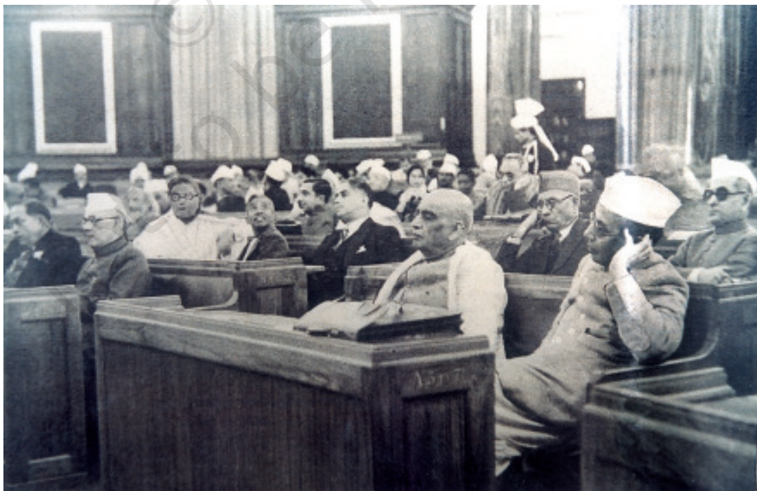
Fig. 15.4 The Constituent Assembly in session Sardar Vallabh Bhai Patel is seen sitting second from right.

The discussions within the Constituent Assembly were also influenced by the opinions expressed by the public. As the deliberations continued, the arguments were reported in newspapers, and the proposals were publicly debated. Criticisms and