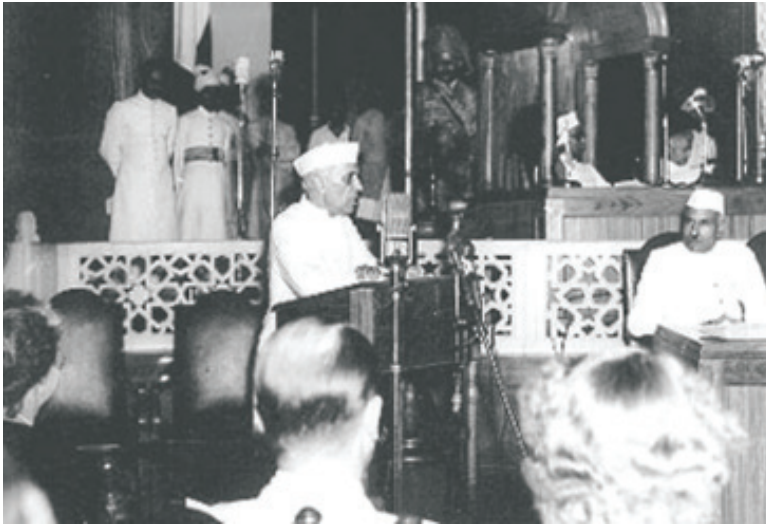
Fig. 15.3 Jawaharlal Nehru speaking in the Constituent Assembly at midnight on 14 August 1947

It was on this day that Nehru gave his famous speech that began with the following lines: