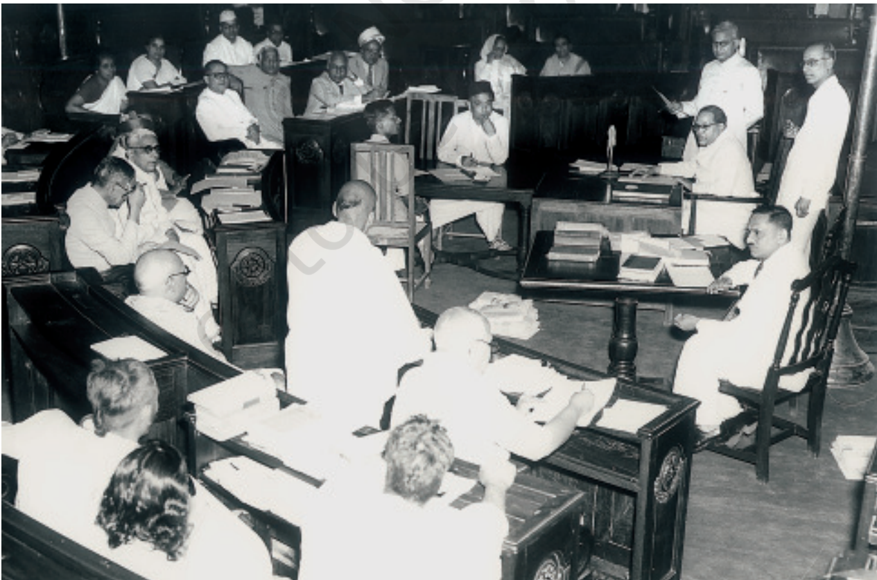
Fig. 15.5 B. R. Ambedkar presiding over a discussion of the Hindu Code Bill

Look again at Chapters 13 and 14. Discuss how the political situation of the time may have shaped the nature of the debates within the Constituent Assembly.