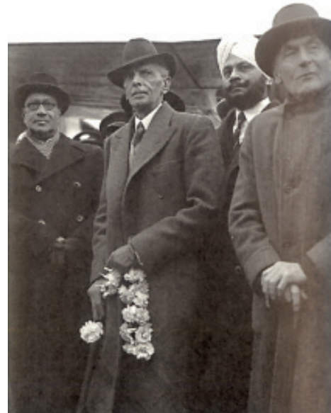
Fig. 15.8 In the winter of 1946 Indian leaders went to London for what turned out to be a fruitless round of talks with British Prime Minister Attlee. (Left to right: Liaquat Ali, Mohammad Ali Jinnah, Baldev Singh and Pethick-Lawrence)