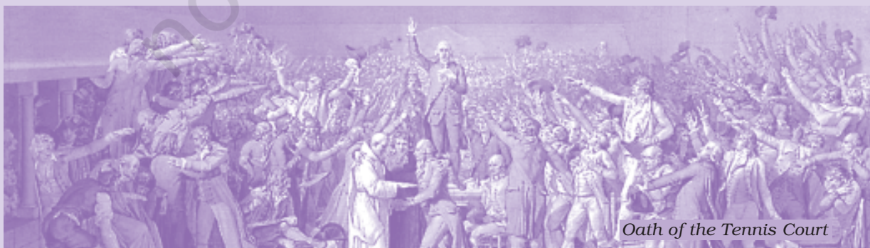
Oath of the Tennis Court

CONSTITUENT ASSEMBLY DEBATES (CAD), VOL. I