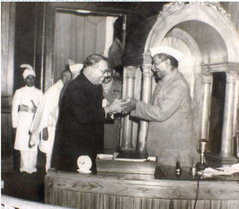
Fig. 15. 9 B. R. Ambedkar and Rajendra Prasad greeting each other at the time of the handing over of the Constitution

The Constituent Assembly debates help us understand the many conflicting voices that had to be negotiated in framing the Constitution, and the many demands that were articulated. They tell us about the ideals that were invoked and the principles that the makers of the Constitution operated with. But in reading these debates we need to be aware that the ideals invoked were very often re-worked according to what seemed appropriate within a context. At times the members of the Assembly also changed their ideas as the debate unfolded over three years. Hearing others argue, some members rethought their positions, opening their minds to contrary views, while others changed their views in reaction to the events around.