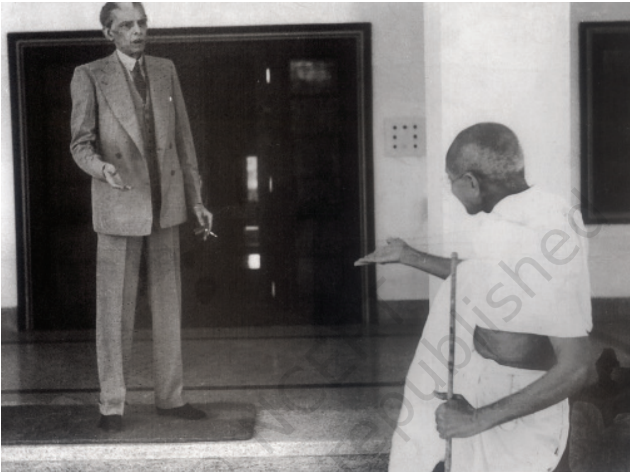
Fig. 14.6 Mahatma Gandhi with Mohammad Ali Jinnah before a meeting with the Viceroy in November 1939

largely Muslims. The British had no intention of annoying the Unionists who still controlled the Punjab government and had been consistently loyal to the British.