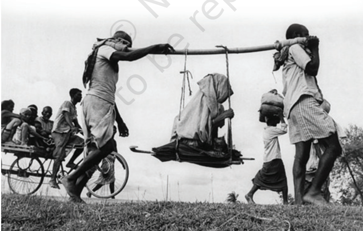
Fig. 14.15 Not everyone could travel by cart, not everyone could walk...

In the final analysis, many different kinds of source materials have to be used to construct a comprehensive account of Partition, so that we see it not only as an event and process, but also understand the experiences of those who lived through those traumatic times.