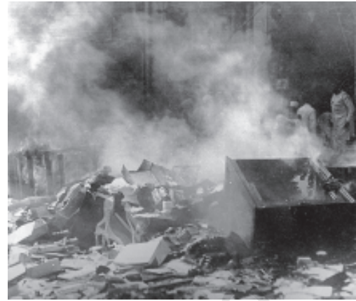
Fig. 14.2 Photographs give us a glimpse of the violence of that time.

also discuss how the history of these experiences can be reconstructed by talking to people and interviewing them, that is, through the use of oral history. At the same time, it will point out the strengths and limitations of oral history. Interviews can tell us about certain aspects of a society's past of which we may know very little or nothing from other types of sources. But they may not reveal very much about many matters whose history we would then need to build from other materials. We will return to this issue towards the end of the chapter.