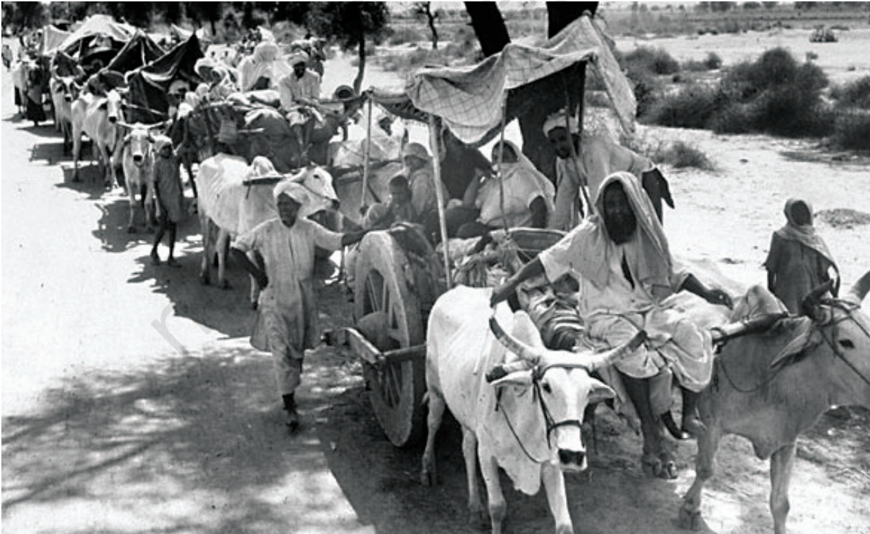
Fig. 14.4 On carts with families and belongings, 1947

The narratives just presented point to the pervasive violence that characterised Partition. Several hundred thousand people were killed and innumerable women raped and abducted. Millions were uprooted, transformed into refugees in alien lands. It is impossible to arrive at any accurate estimate of casualties: informed and scholarly guesses vary from 200,000 to 500,000 people. In all probability, some 15 million had to move across hastily constructed frontiers separating India and Pakistan. As they stumbled across these “shadow lines” – the boundaries between the two new states were not officially known until two days after formal independence – they were rendered homeless, having suddenly lost all their immovable property and most of their movable assets, separated from many of their relatives and friends as well, torn asunder from their moorings, from their houses, fields and fortunes, from their childhood memories. Thus stripped of their local or regional cultures, they were forced to begin picking up their life from scratch.