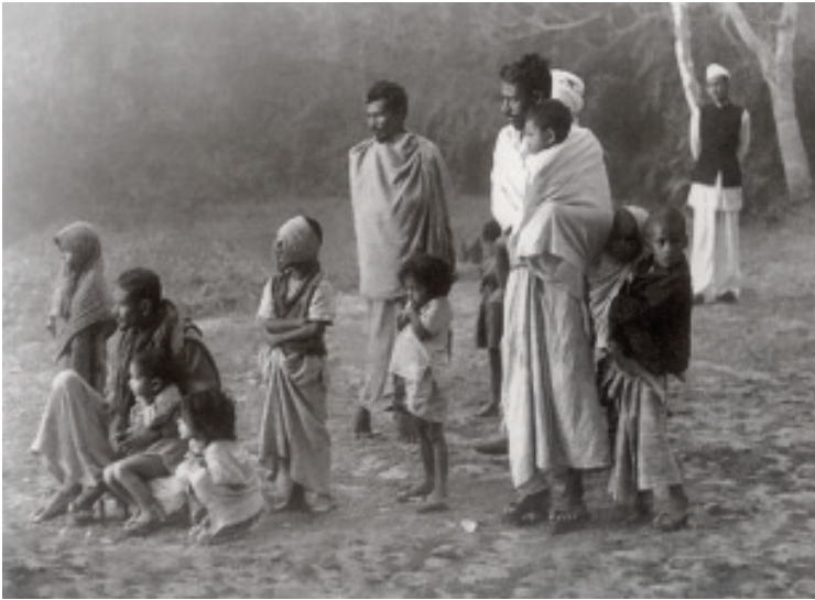
Fig. 14.11 Villagers of a riot-torn village awaiting the arrival of Mahatma Gandhi