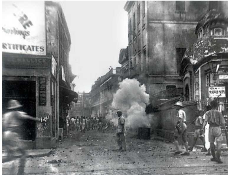
Fig. 14.9 Through those blood-soaked months of 1946, violence and arson spread, killing thousands.