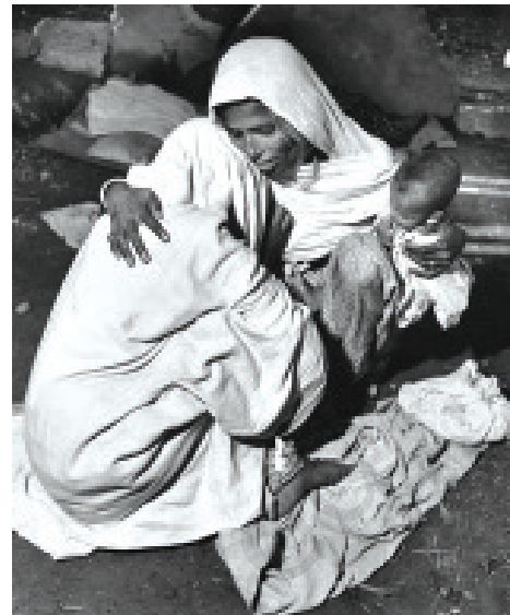
Fig. 14.12 Women console each other as they hear of the death of their family members. Males died in larger numbers in the violence of rioting.

In one instance, a Sikh youth who had run amuck during the Partition persuaded a massacring crowd to let him take away a young, beautiful Muslim girl. They got married, and slowly fell in love with each other. Gradually memories of her parents, who had been killed, and her former life faded. They were happy together, and a little boy was born. Soon, however, social workers and the police, labouring assiduously to recover abducted women, began to track down the couple. They made inquiries in the Sikh’s home-district of Jalandhar; he got scent of it and the family ran away to Calcutta. The social workers reached Calcutta. Meanwhile, the couple’s friends tried to obtain a stay-order from the court but the law was taking its ponderous course. From Calcutta the couple escaped to some obscure Punjab village, hoping that the police would fail to shadow them. But the police caught up with them and began to question them. His wife was expecting again and now nearing her time. The Sikh sent the little boy to his mother and took his wife to a sugar-cane field. He made her as comfortable as he could in a pit while he lay with a gun, waiting for the police, determined not to lose her while he was alive. In the pit he delivered her with his own hands. The next day she ran high fever, and in three days she was dead. He had not dared to take her to the hospital. He was so afraid the social workers and the police would take her away.