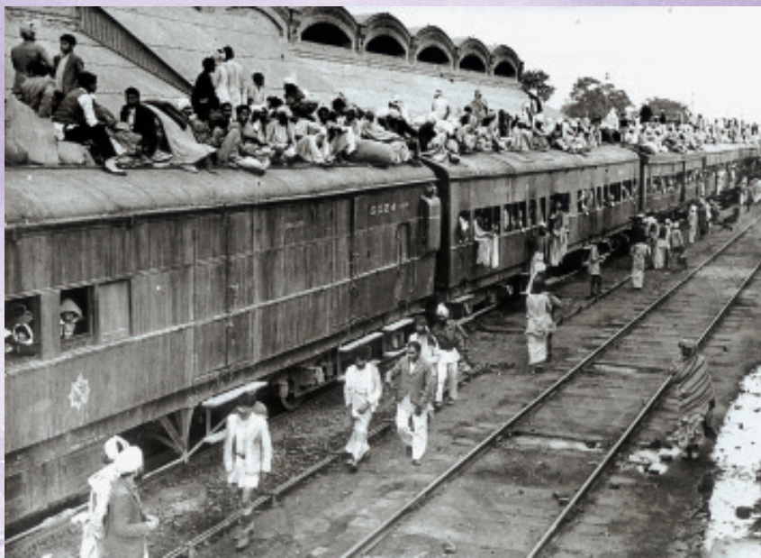
Fig. 14.3 Over 10 million people were uprooted from their homelands and forced to migrate.

“That ‘Stop!’ sounded like a brute order to me and I instantly thought now I’ll be gone. This Sikh will finish me off. But there was no escaping the situation, so I stopped. The burly Sikh came running to me and gave me a mighty hug. Eyes moist, he said, ‘For quite a few years now, I have not met a Punjabi Musalman . I have been longing to meet one but you cannot find Punjabi-speaking Musalman s here.’”