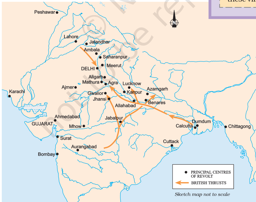
Map 2 The map shows the important centres of revolt and the lines of British attack against the rebels.

➔ What, according to this account, were the problems faced by the British in dealing with these villagers?