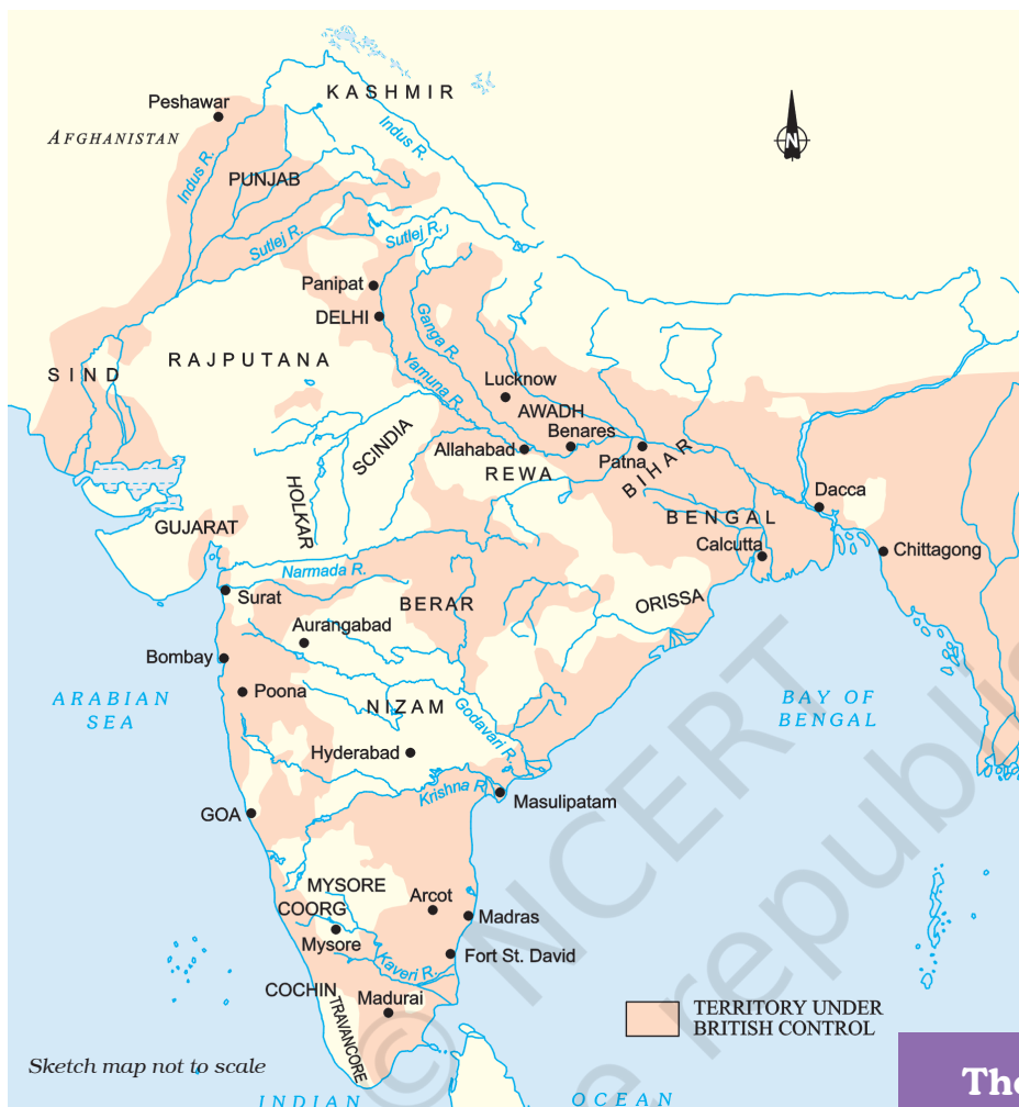
Map 1 Territories under British control in 1857