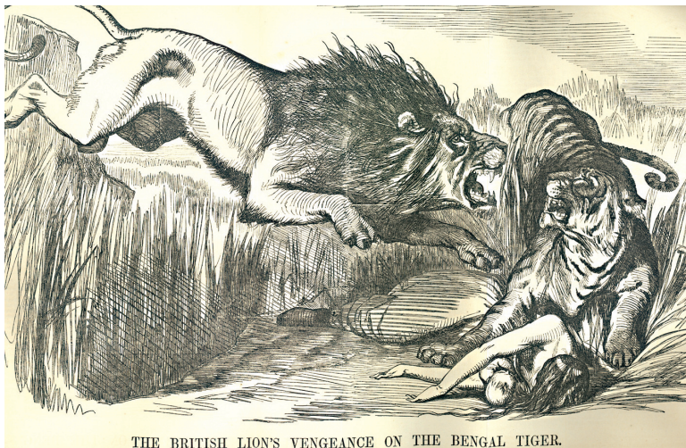
Fig. 11.14 The caption at the bottom reads “The British Lion’s Vengeance on the Bengal Tiger”, Punch, 1857.

➤ What idea is the picture projecting? What is being expressed through the images of the lion and the tiger? What do the figures of the woman and the child depict?