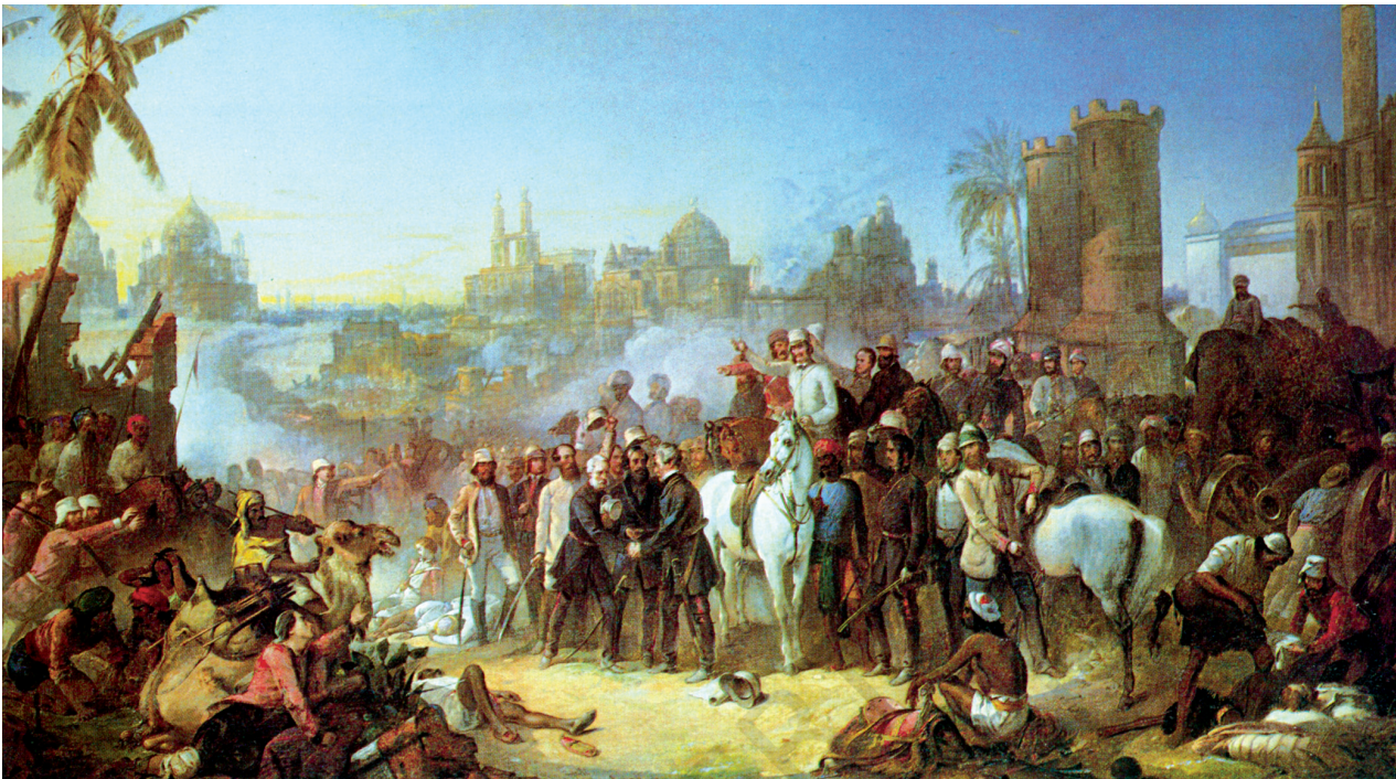
Fig. 11.10 "Relief of Lucknow", painted by Thomas Jones Barker, 1859

was appointed as the new Commander of British forces in India, came with his forces and rescued the besieged British garrison. In British accounts the siege of Lucknow became a story of survival, heroic resistance and the ultimate triumph of British power.