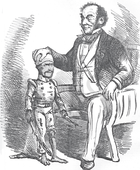
THE CLEMENCY OF CANNING.

In one of the cartoons published in the pages of Punch , a British journal of comic satire, Canning is shown as a looming father figure, with his protective hand over the head of a sepoy who still holds an unsheathed sword in one hand and a dagger in the other, both dripping with blood (Fig.11.17) – an imagery that recurs in a number of British pictures of the time.