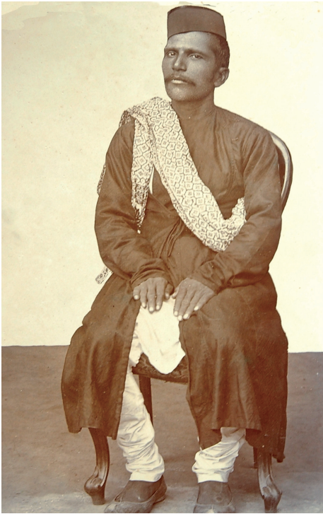
Fig. 11.6 A zamindar from Awadh, 1880

and issues, traditions and loyalties worked themselves out in the revolt of 1857. In Awadh, more than anywhere else, the revolt became an expression of popular resistance to an alien order.