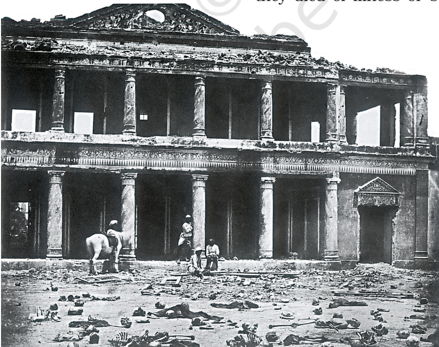
Fig. 11.9 Secundrah Bagh, Lucknow, photograph by Felice Beato, 1858

The British used military power on a gigantic scale. But this was not the only instrument they used. In large parts of present-day Uttar Pradesh, where big landholders and peasants had offered united resistance, the British tried to break up the unity by promising to give back to the big landholders their estates. Rebel landholders were dispossessed and the loyal rewarded. Many landholders died fighting the British or they escaped into Nepal where they died of illness or starvation.