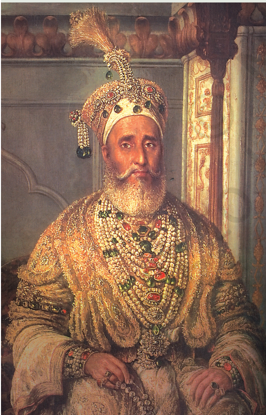
Fig. 11.1 Portrait of Bahadur Shah

Late in the afternoon of 10 May 1857, the sepoys in the cantonment of Meerut broke out in mutiny. It began in the lines of the native infantry, spread very swiftly to the cavalry and then to the city. The ordinary people of the town and surrounding villages joined the sepoys. The sepoys captured the bell of arms where the arms and ammunition were kept and proceeded to attack white people, and to ransack and burn their bungalows and property. Government buildings – the record office, jail, court, post office, treasury, etc. – were destroyed and plundered. The telegraph line to Delhi was cut. As darkness descended, a group of sepoys rode off towards Delhi.