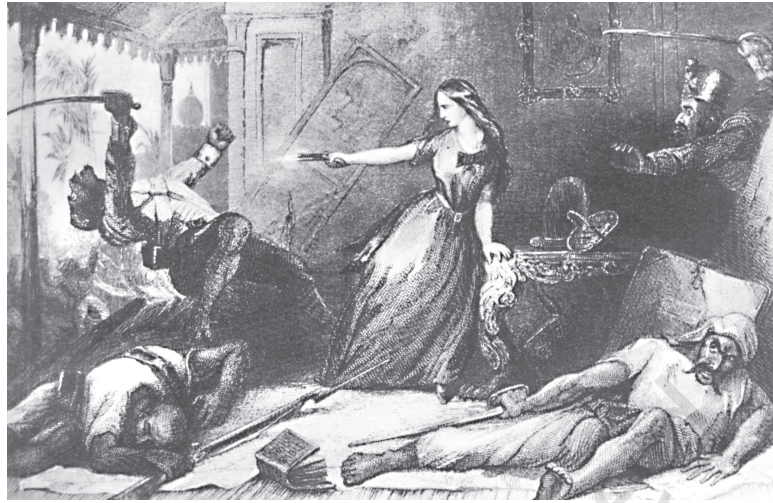
Fig. 11.12 Miss Wheeler defending herself against sepoys in Kanpur