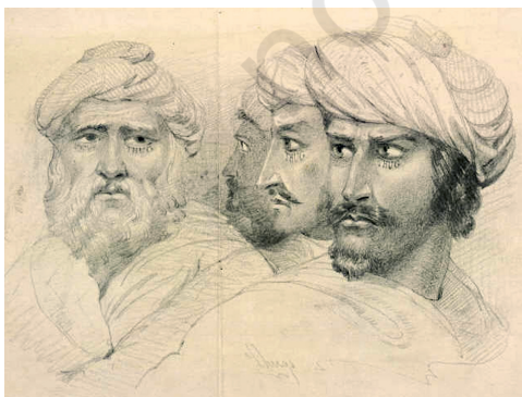
Fig. 11.19 Faces of rebels