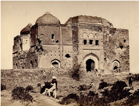
Fig. 11.8 A mosque on the Delhi Ridge, photograph by Felice Beato, 1857-58 After 1857, British photographers recorded innumerable images of desolation and ruin.

attempts to recover Delhi began in earnest in early June 1857 but it was only in late September that the city was finally captured. The fighting and losses on both sides were heavy. One reason for this was the fact that rebels from all over North India had come to Delhi to defend the capital.