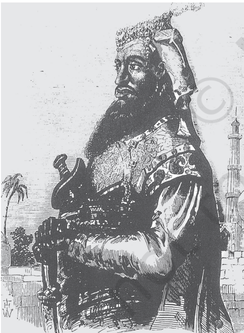
Fig. 11.4 Nana Sahib At the end of 1858, when the rebellion collapsed, Nana Sahib escaped to Nepal. The story of his escape added to the legend of Nana Sahib's courage and valour.