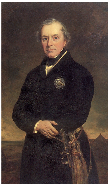
Fig. 11.5 Henry Hardinge, by Francis Grant, 1849

As Governor General, Hardinge attempted to modernise the equipment of the army. The Enfield rifles that were introduced initially used the greased cartridges the sepoys rebelled against.