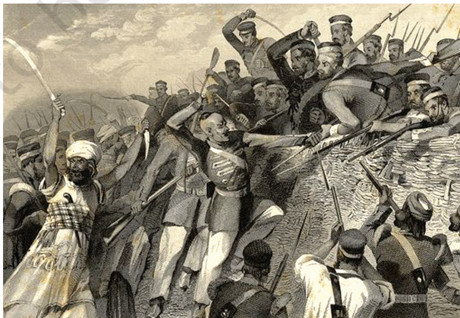
Fig. 11.2 Ordinary people join the sepoys in attacking the British in Lucknow.

Firangi , a term of Persian origin, possibly derived from Frank (from which France gets its name), is used in Urdu and Hindi, often in a derogatory sense, to designate foreigners.