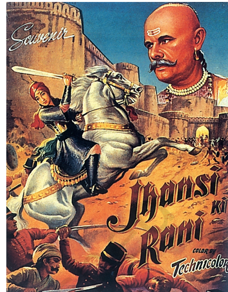
Fig. 11.18 Films and posters have helped create the image of Rani Lakshmi Bai as a masculine warrior

These images did not only reflect the emotions and feelings of the times in which they were produced. They also shaped sensibilities. Fed by the images that circulated in Britain, the public sanctioned the most brutal forms of repression of the rebels. On the other hand, nationalist imageries of the revolt helped shape the nationalist imagination.