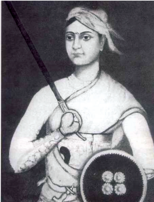
Fig. 11.3 Rani Lakshmi Bai, a popular image