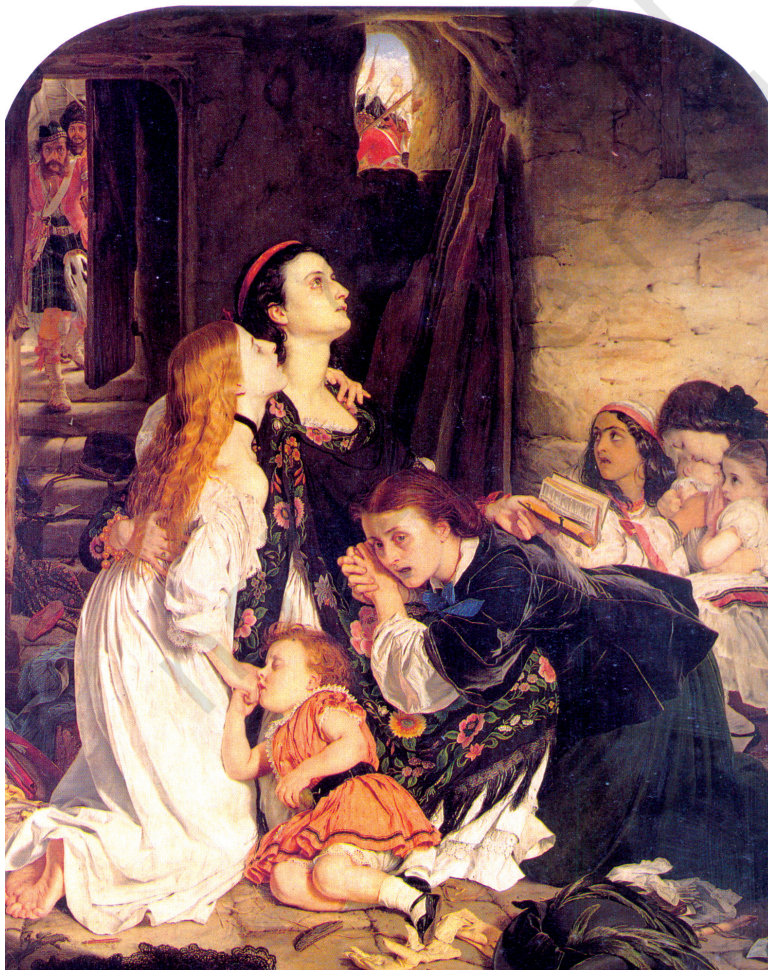
Fig. 11.11 "In Memoriam", by Joseph Noel Paton, 1859

"In Memoriam" (Fig. 11.11) was painted by Joseph Noel Paton two years after the mutiny. You can see English women and children huddled in a circle, looking helpless and innocent, seemingly waiting for the inevitable – dishonour, violence and death. "In Memoriam" does not show gory violence; it only suggests it. It stirs up the spectator's imagination, and seeks to provoke anger and fury. It represents the rebels as violent and brutish, even though they remain invisible in the picture. In the background you can see the British rescue forces arriving as saviours.