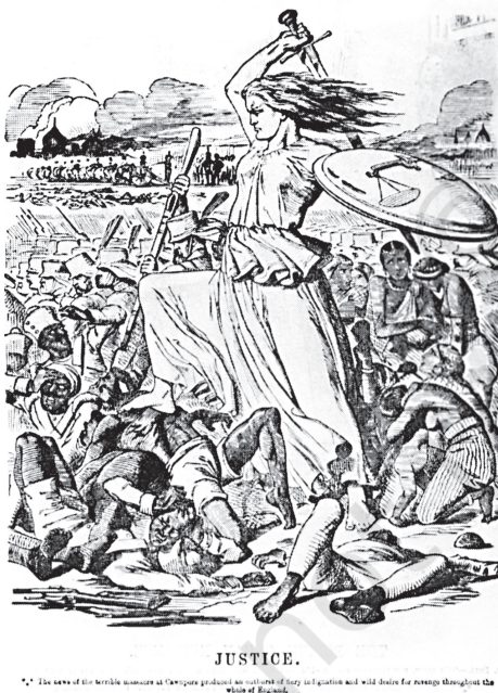
Fig. 11.13 Justice , Punch, 12 September 1857 The caption at the bottom reads “The news of the terrible massacre at Cawnpore (Kanpur) produced an outburst of fiery indignation and wild desire for revenge throughout the whole of England.”

In another set of sketches and paintings we see women in a different light. They appear heroic, defending themselves against the attack of rebels. Miss Wheeler in Figure 11.12 stands firmly at the centre, defending her honour, single-handedly killing the attacking rebels. As in all such British representations, the rebels are demonised. Here, four burly males with swords and guns are shown attacking a woman. The woman's struggle to save her honour and her life, in fact, is represented as having a deeper religious connotation: it is a battle to save the honour of Christianity. The book lying on the floor is the Bible.