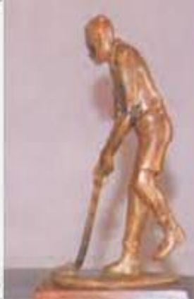
Table tennis legend Achanta Sharath Kamal bestowed with the Major Dhyan Chand Khel Ratna award for his outstanding performance in the Commonwealth Games, 2022 by the President as part of the National Sports and Adventure Awards 2022.